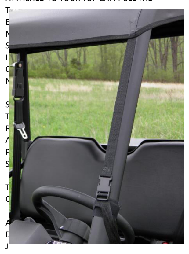
UST THE POSITION OF YOUR TOP CAP.