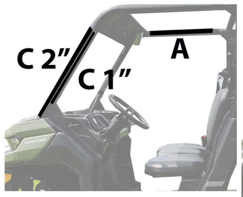
Figure 1: Place adhesive Velcro as shown in photo. 2" strip C is for the Velcro sewn on to the front of the door kit, 1" strip C is for the straps sewn onto the front of the door panel. Wrap straps around the roll bar and attach to 1" strips C.