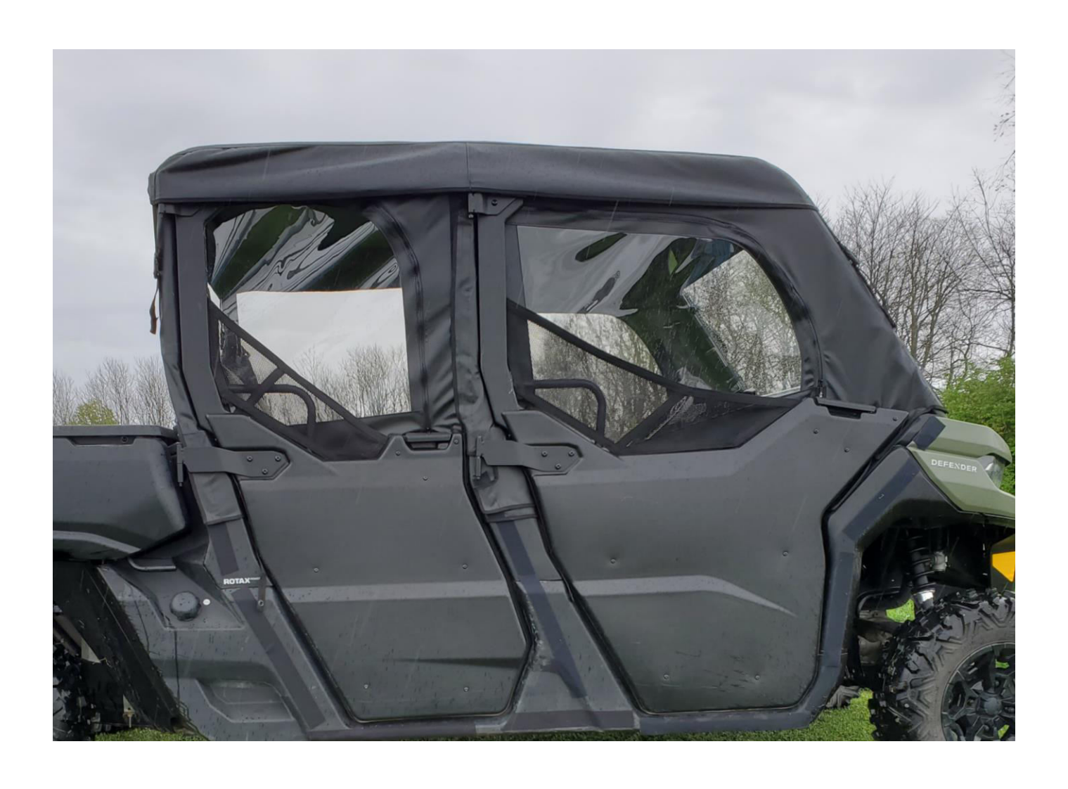
Reinstall the hard door over the soft window.