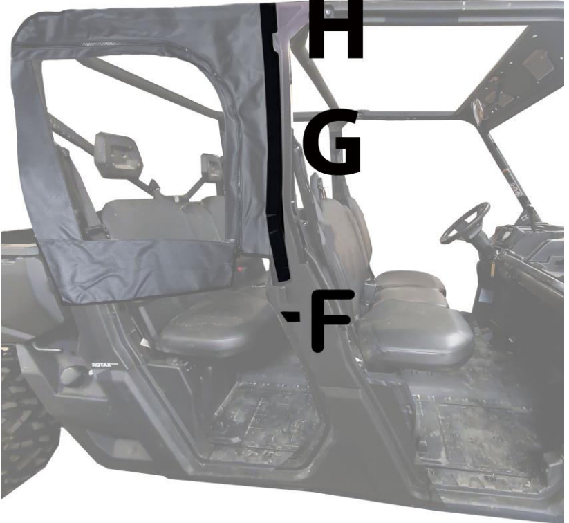
PLACE SMALL STRIP F BELOW THE HALF DOOR HINGE.