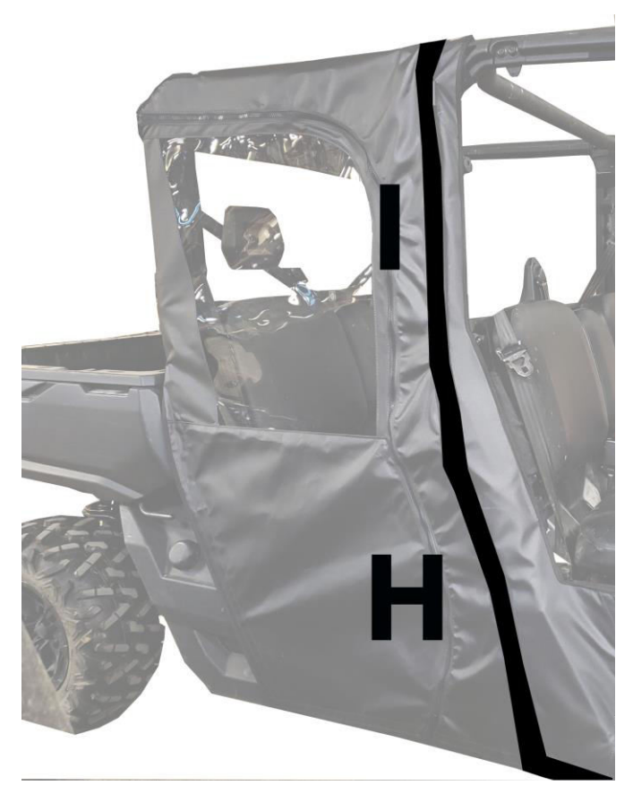
Figure 3: This Velcro is sewn on to the front of the back door.