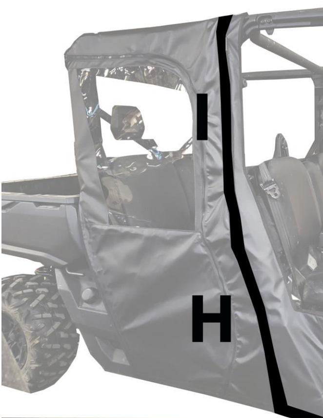
Figure 3: This Velcro is sewn on to the front of the back door.