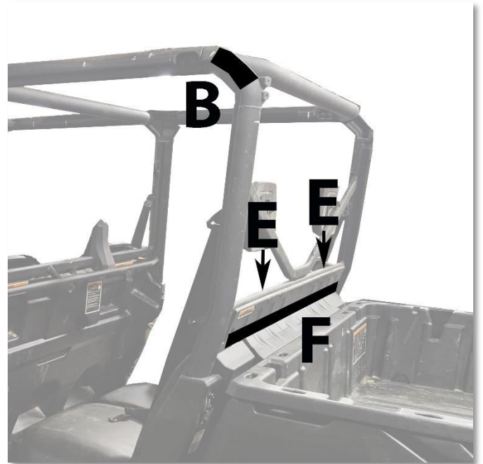
Figure 2: the double sided straps associated with strip B will wrap around the roll bar. Tabs E will fold over the back of the seat and attach in between the seat and the rear frame.