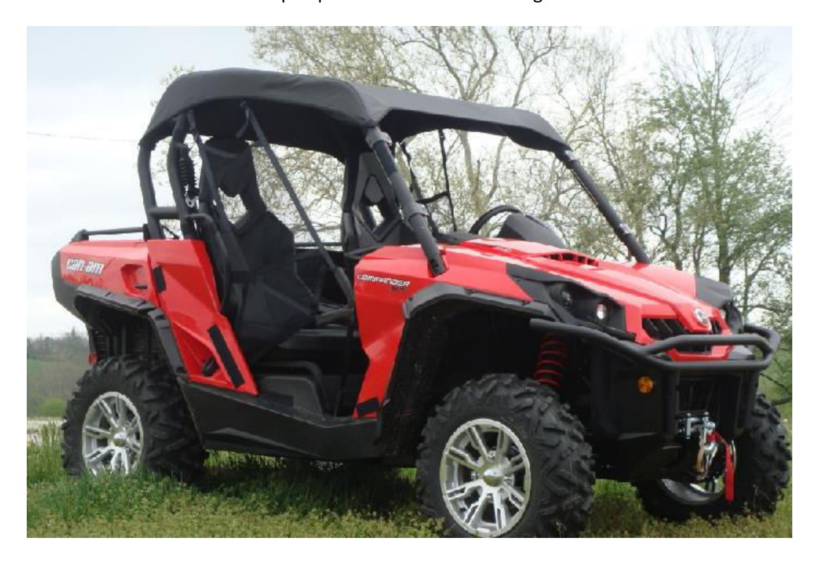
Figure 5.1 - re-tighten each Velcro Tab until the Top Cap is tight on all sides and no major wrinkles are showing.

See enclosed Product Care sheet for instructions on how to properly care for your 3SI UTV Enclosure.