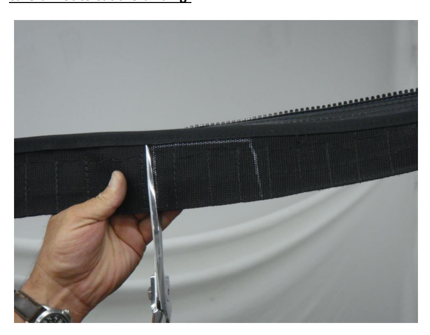
Step 6: After the doors are in place, the webbing/Velcro strips running the length of the front roll bars must be cut to accommodate the windshield clamps. Cut sections out of the Velcro tab where your clamps will be positioned. Be careful not to cut the binding.

Step 5: Place the doors on the cab frame. If necessary, remove and re-attach adhesive Velcro strips to match sewn-in Velcro loop.