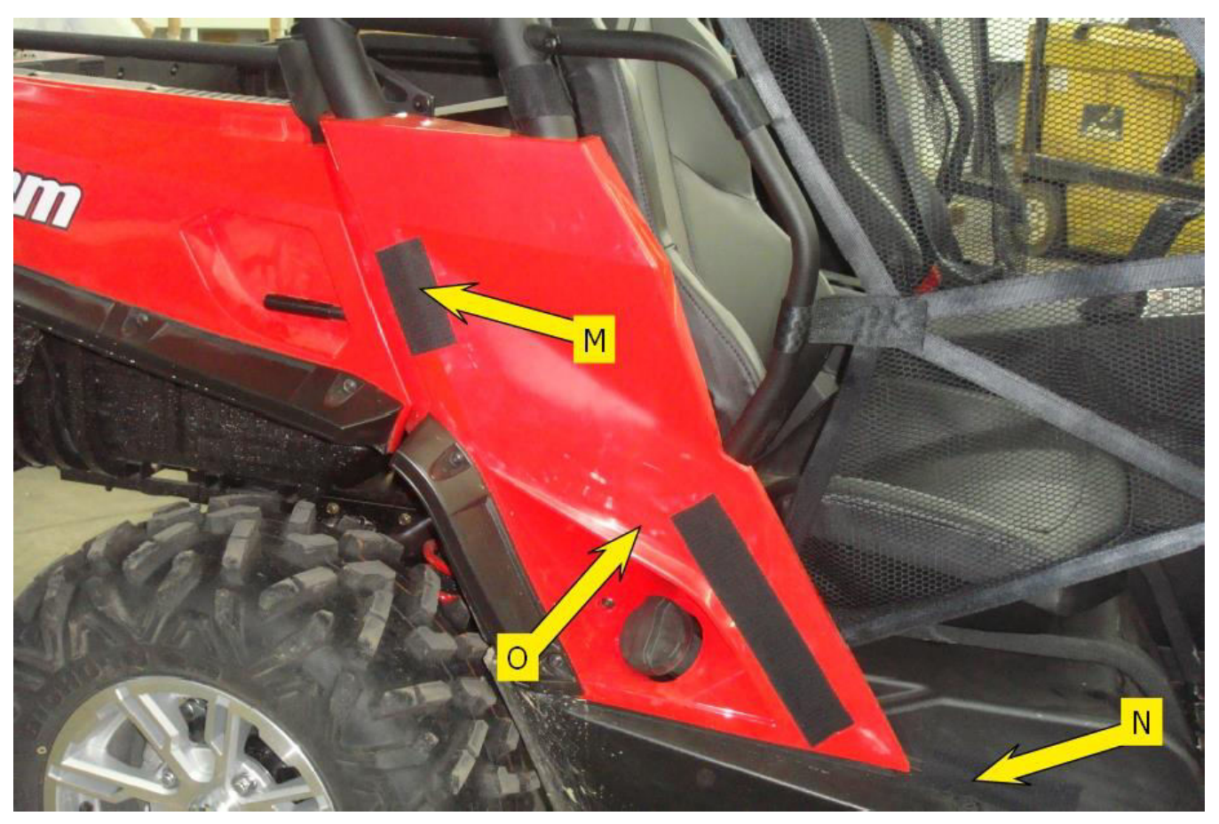
The Velcro strips shown above are NOT full size strips.