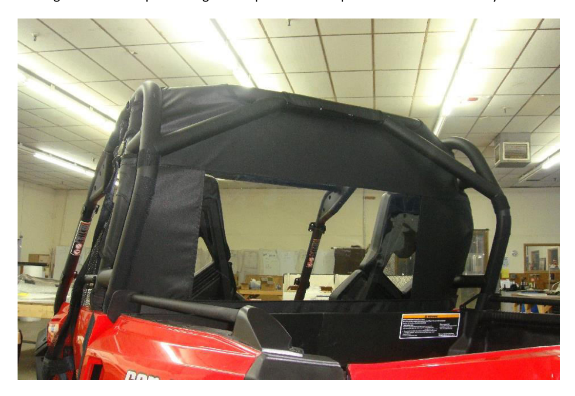
Step 4: After all adhesive Velcro strips are attached, with the exception of the front roll bars, begin attaching enclosure starting with the back panel. Align and square the back panel to the cab frame as you connect the Velcro strips.

Note: The middle/top of the back panel wraps around the cross bar from the inside of the bar.