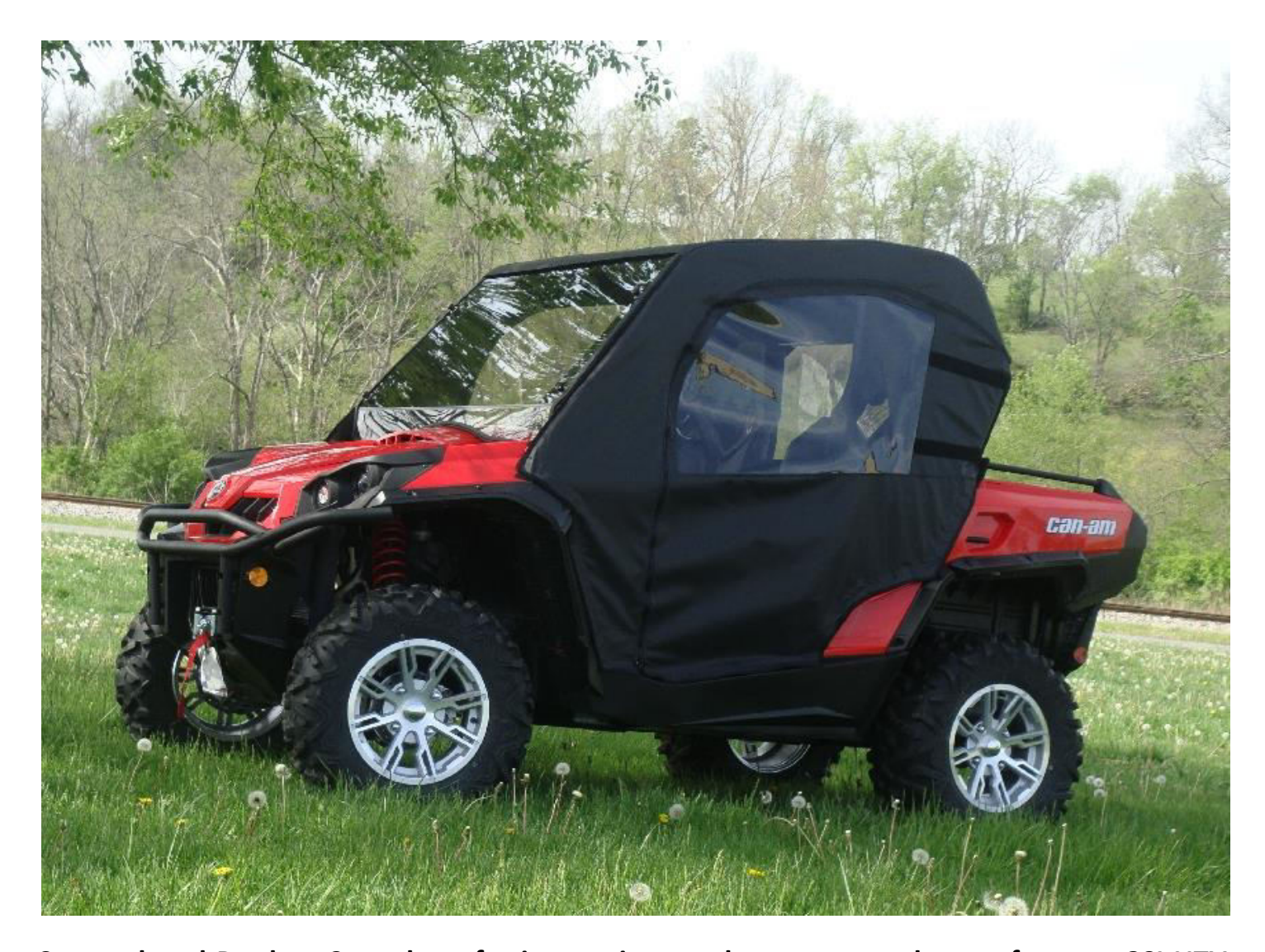
See enclosed Product Care sheet for instructions on how to properly care for your 3SI UTV Enclosure.