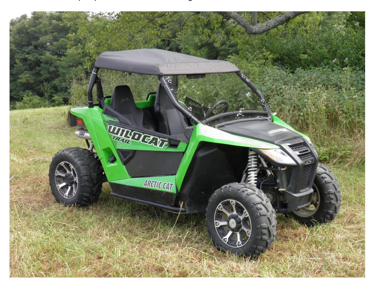
Figure 5.1 - re-tighten each Velcro Tab until the Top Cap is tight on all sides and no major wrinkles are showing.

Step 5: Repeat step 4 pulling downward firmly and re-attaching each of the Velcro Tabs until the Top Cap is tight and there are no wrinkles in the Top Cap Enclosure as shown in figure 5.1