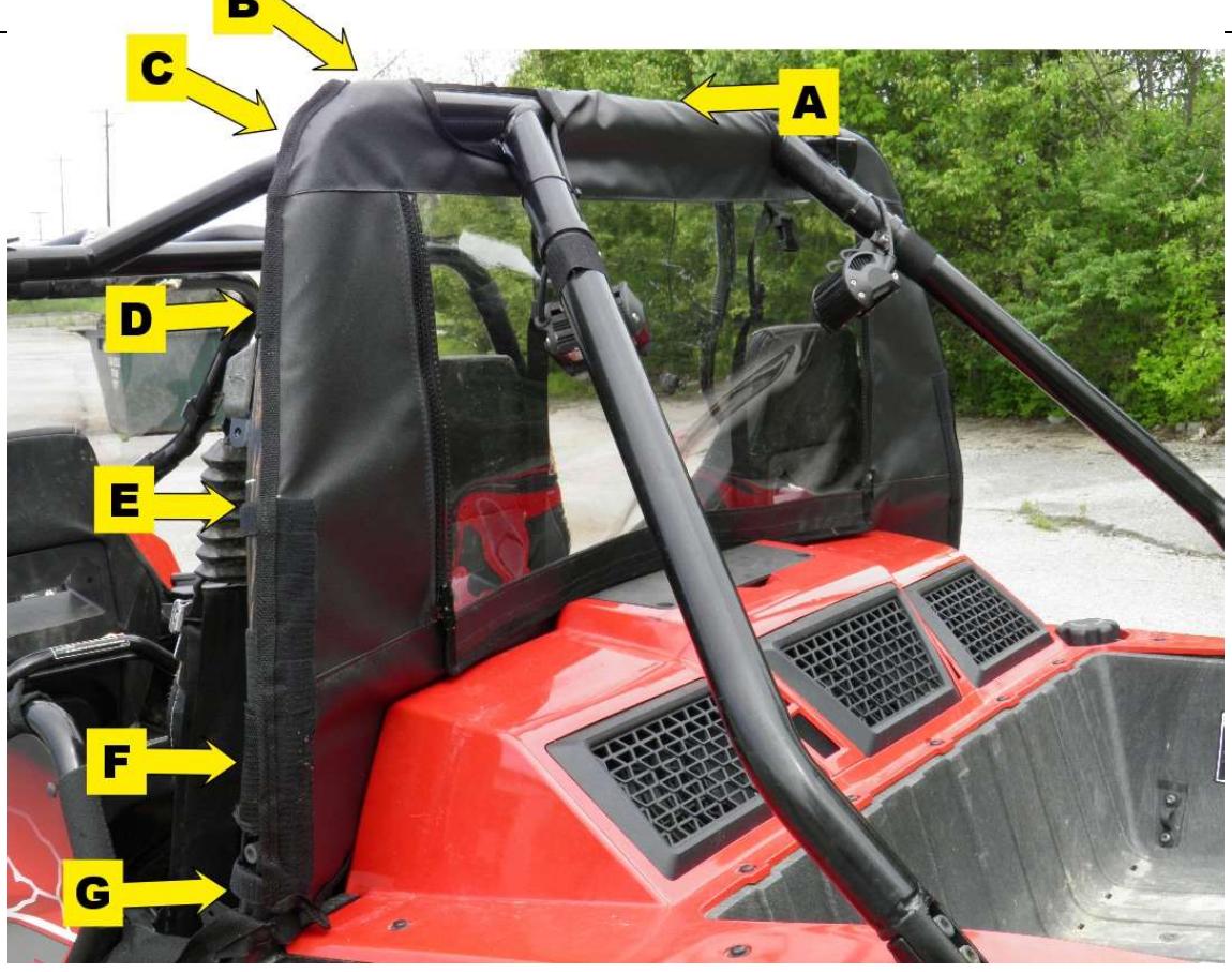
Step 3: Drape the windshield/top over the cab frame. Note, the 5" webbing/loop tab is located in the FRONT visor. The two double-sided strap are on the rear visor. The top attaches to the cab frame with tension straps. Attach the adhesive hook strips per the table and pictures below.