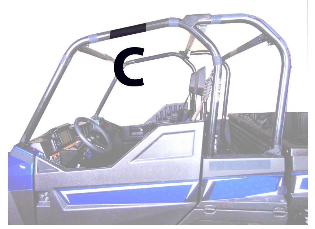
Figure 1: Place horizontally on the side roll bar, pull the tab on the roll bar over and around the top of the machine and stick to the adhesive Velcro.