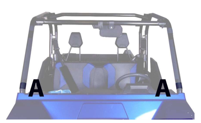
Figure 1: WRAP THESE VELCRO STRIPS AROUND THE ROLL BAR AND ATTACH DOUBLE-SIDED STRAP.