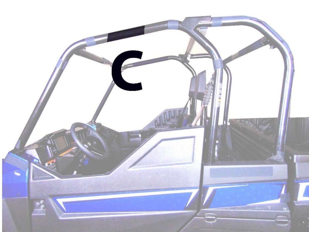
Figure 1: Place horizontally on the side roll bar, pull the tab on the roll bar over and around the top of the machine and stick to the adhesive Velcro.