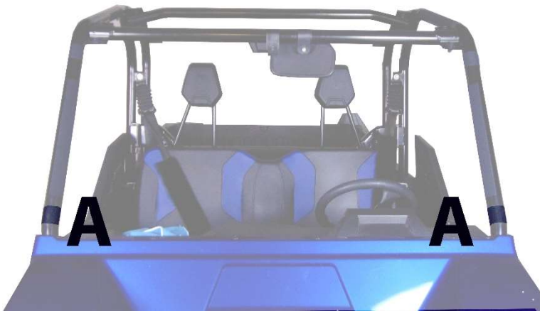
Figure 1: WRAP THESE VELCRO STRIPS AROUND THE ROLL BAR AND ATTACH DOUBLE-SIDED STRAP.