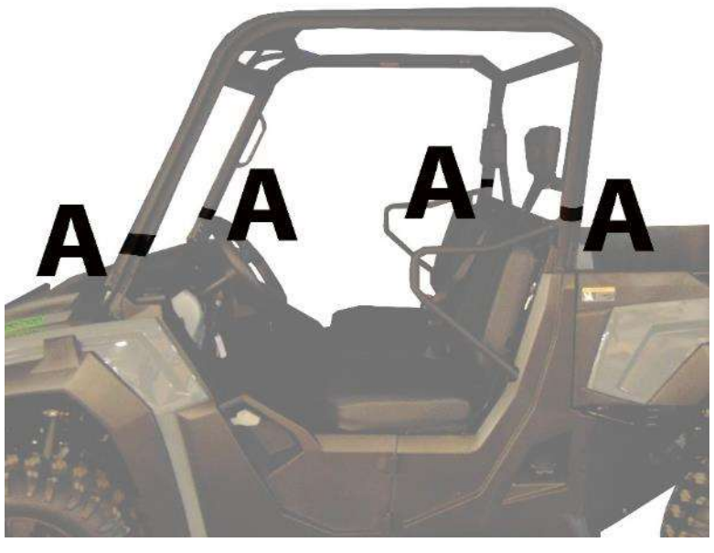
Figure 1: WRAP THESE VELCRO STRIPS AROUND THE ROLL BAR AND ATTACH DOUBLE-SIDED STRAP.