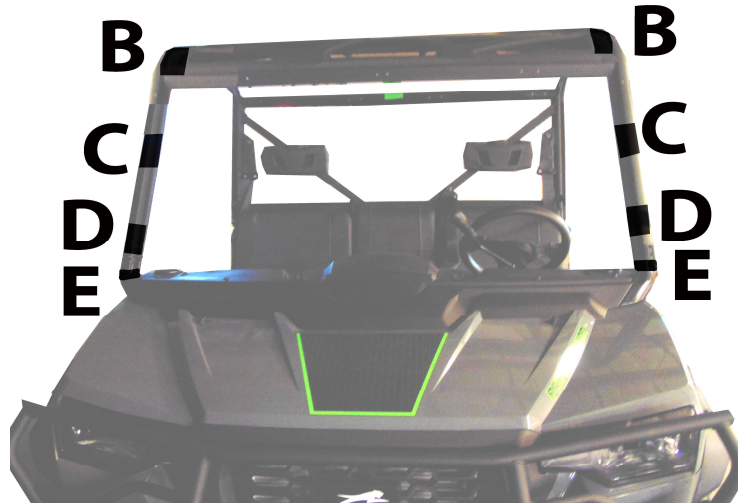
Figure 2: Shows placement of 6" Velcro strips B. Wraps these strips around the roll bars on passenger and drivers side.