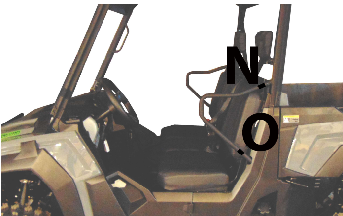
Figure 5: Shows placement of 16" Velcro strips E. These strips are installed on the top back roll bar extending down the curve.