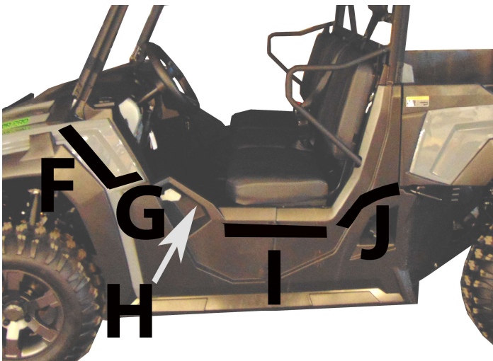
Figure 3: Shows placement of 14" Velcro strips C.