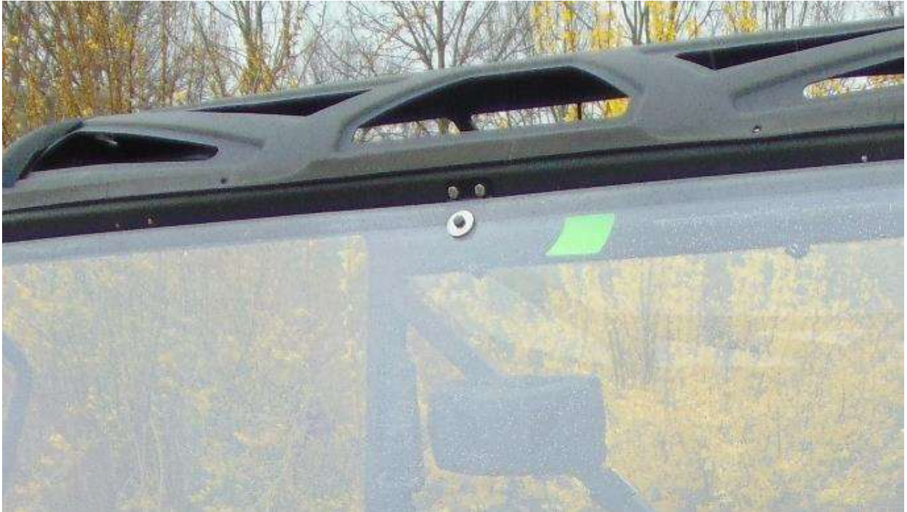
Step 4: On each side of the windshield, feed a Quick Attach Strap into the slot in the windshield from the outside. Please note, the "Velcro" side of the strap should face inward. Wrap the strap around the roll bar and feed the strap through the buckle. Pull the strap tight and adhere the hook end of the strap to the loop strap.

Step 5: Adjust the straps as needed to tighten down the windshield.