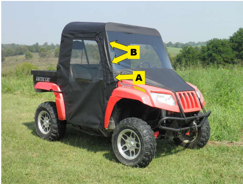
*Full Cab with Vinyl Windshield Shown