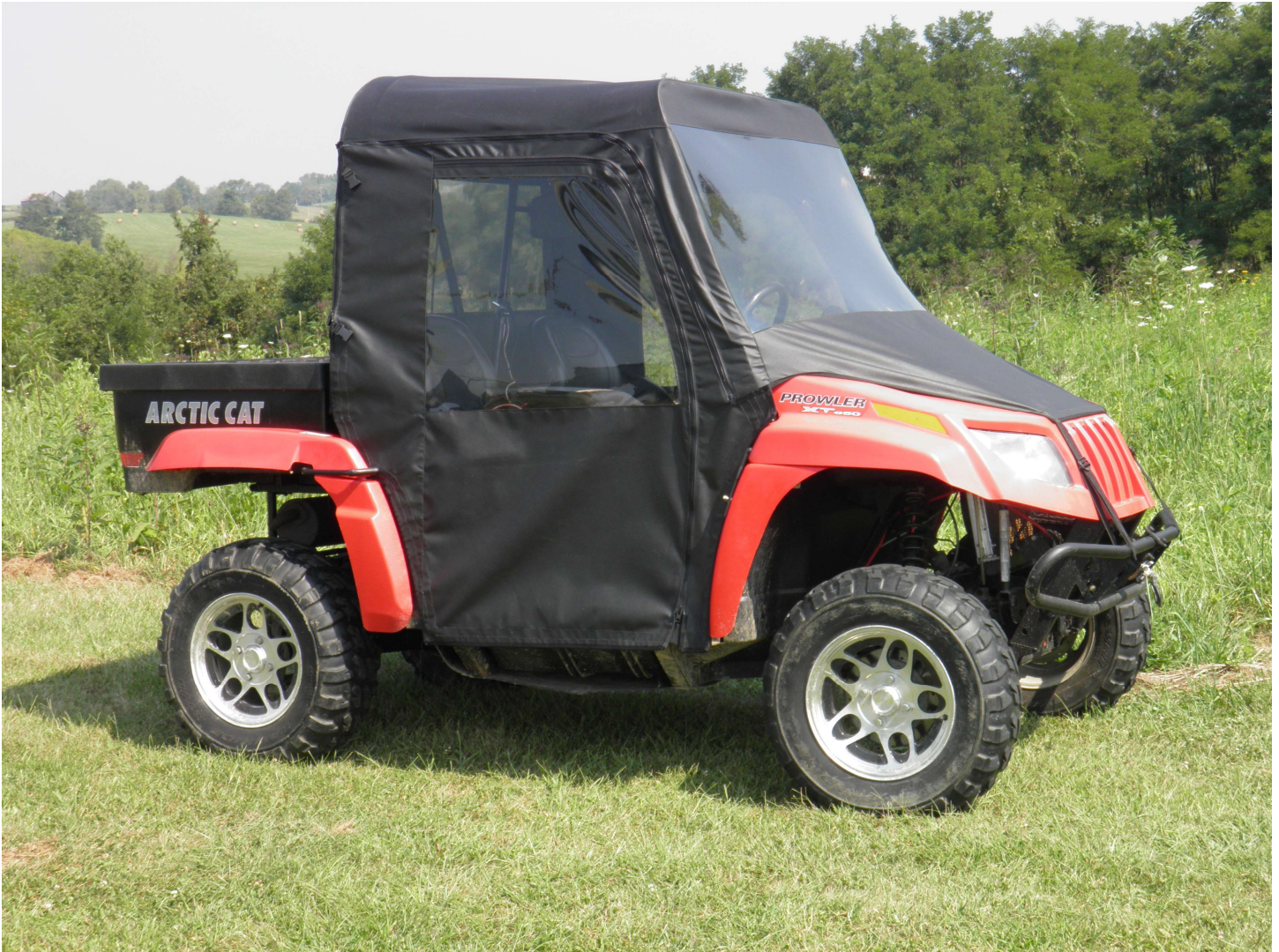
*Full Cab with Vinyl Windshield Shown

Step 10: Repeat any steps necessary to achieve a tight fit to the roll bar frame as shown below.