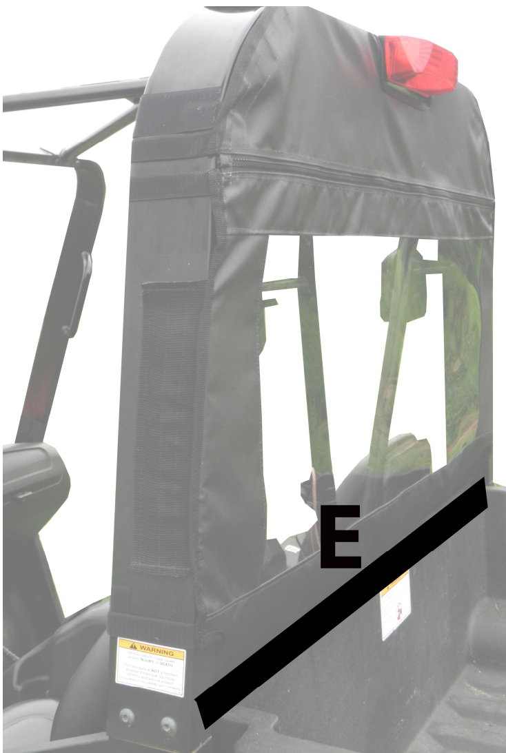
Figure 3: Shows position of strip E, all the way across the back of the UTV, you will need to raise the bed to access this location.