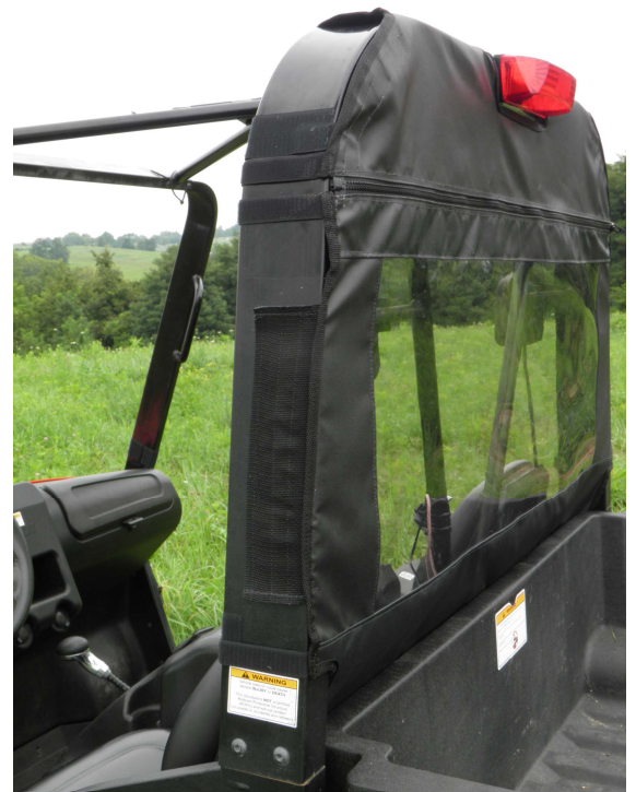
Figure 4: when installation is complete back panel should resemble photo.