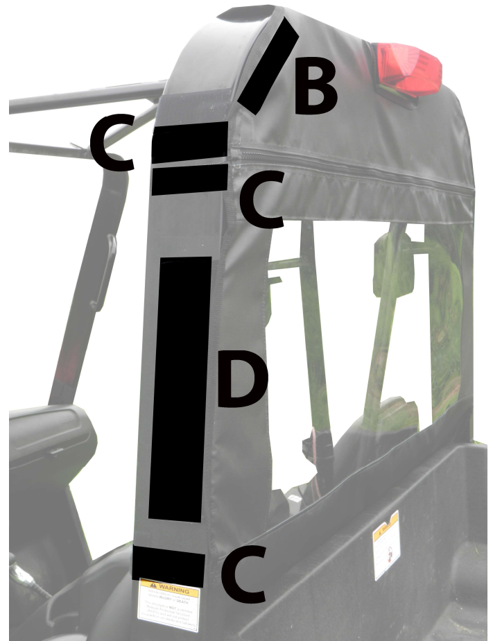
Figure 2: Shows position of B, C, AND D.