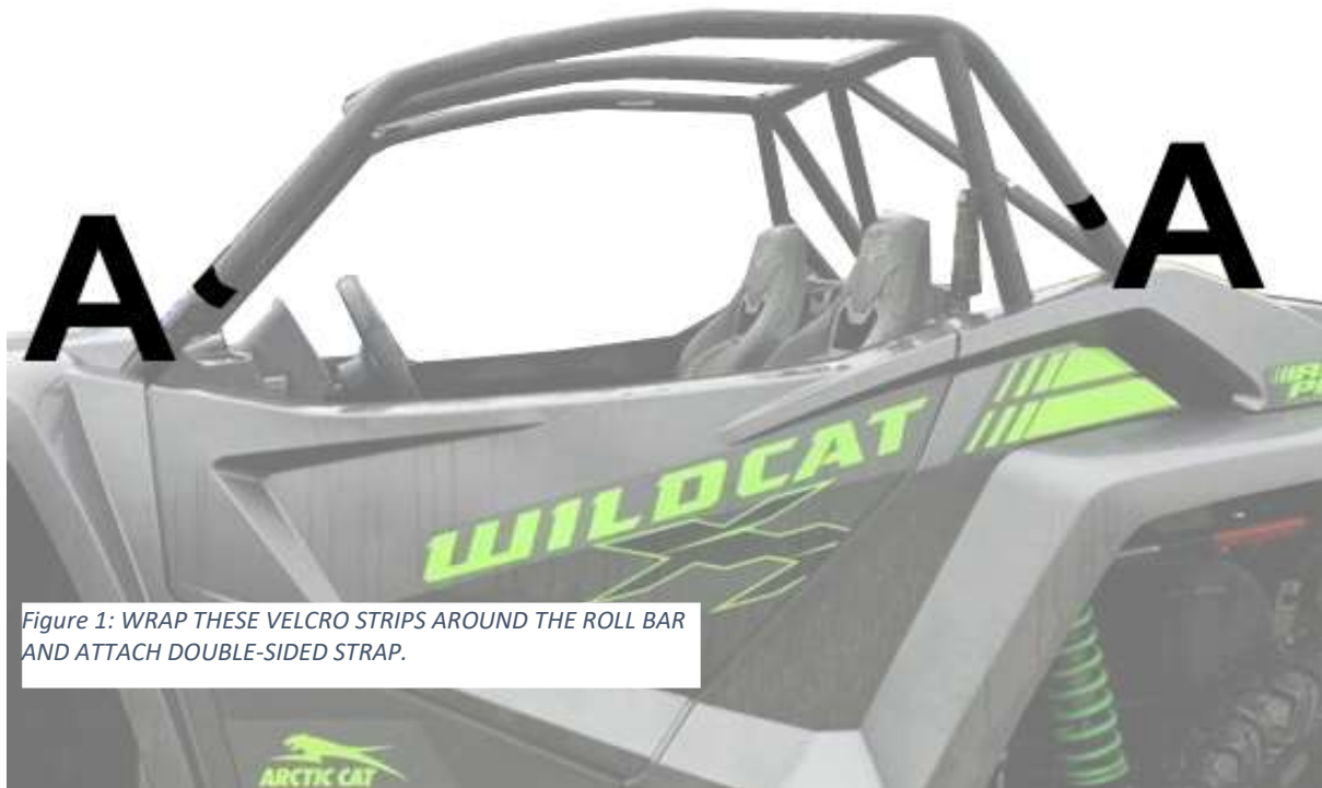
Figure 1: WRAP THESE VELCRO STRIPS AROUND THE ROLL BAR AND ATTACH DOUBLE-SIDED STRAP.