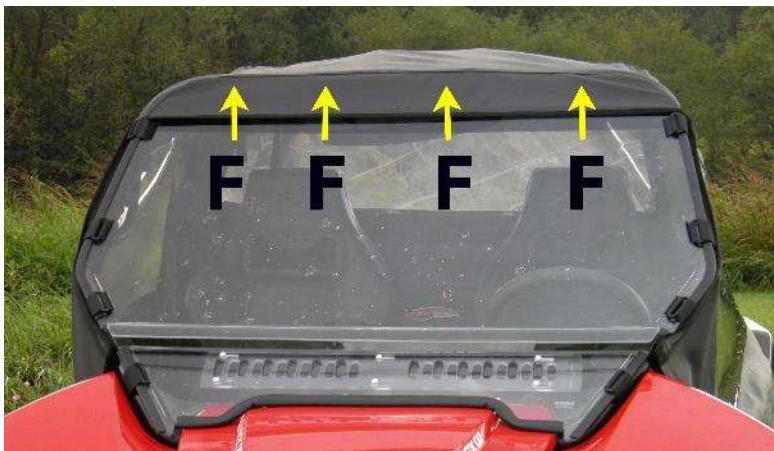
Figure 5: Photo shows placement of Velcro strips F. place strips on the underside of the roll bar. Pull tabs over the top of the roll bars and attach to the underside of the roll bar.