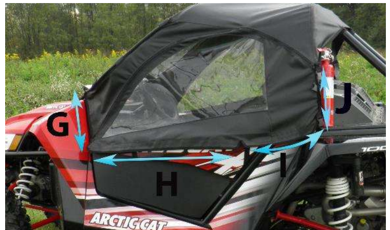
Figure 6: Place strips of the outside of the machine according to the picture.