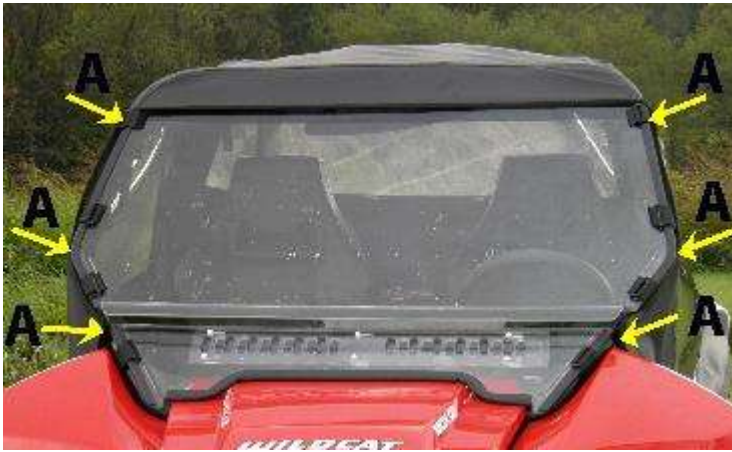
Figure 1: Shows placement of Velcro strips A, wrap these strips around the roll bar.