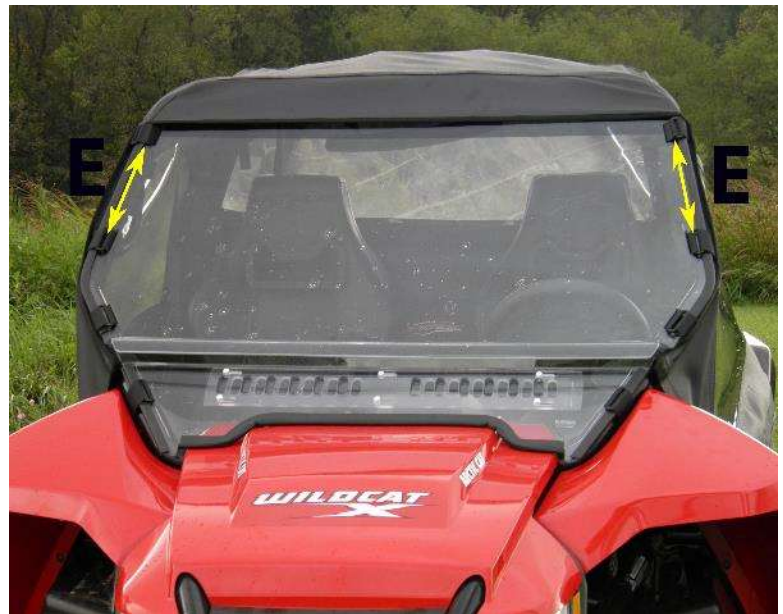
Figure 4: Shows placement of Velcro strips E, on the forward facing roll bar Velcro facing the outside of the UTV.