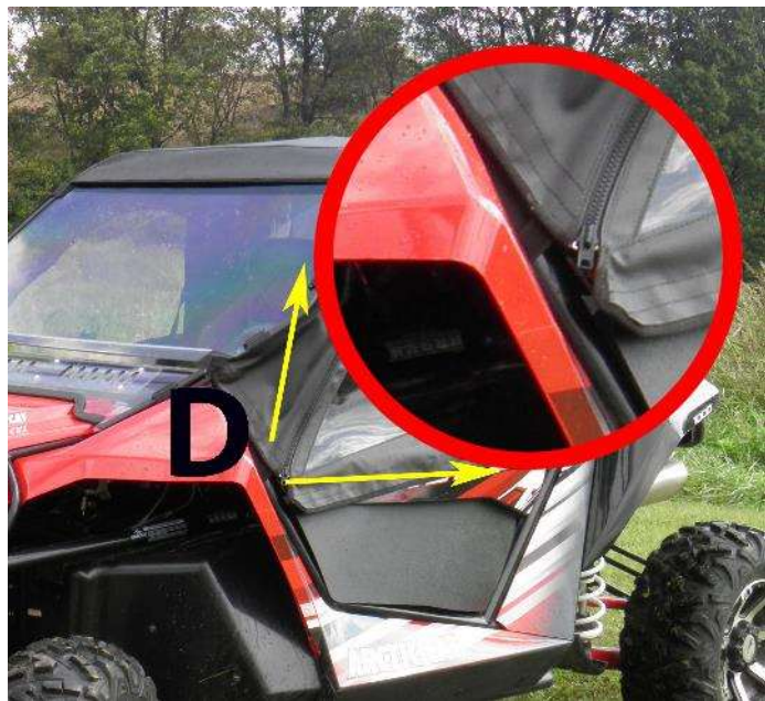
Figure 1: Shows placement of Velcro strips D. Wrap around the roll bar for small strap D.