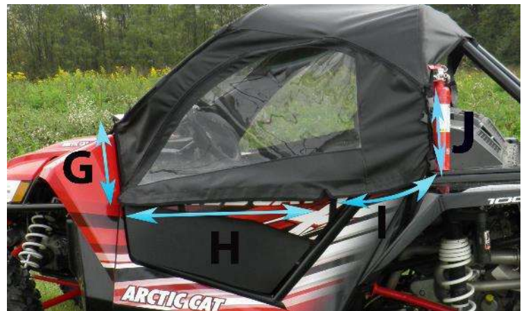
Figure 6: Place strips of the outside of the machine according to the picture.