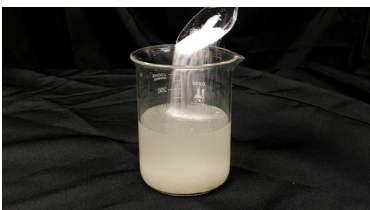
Add Liquid Lock to slurry liquid