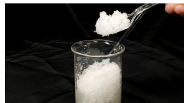
In minutes, slurry turns into a solid for safe transport & disposal.