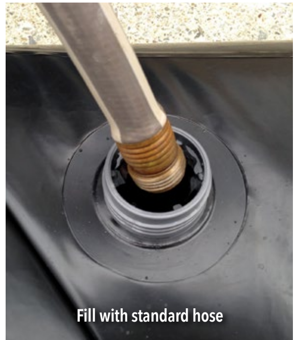
Fill with standard hose