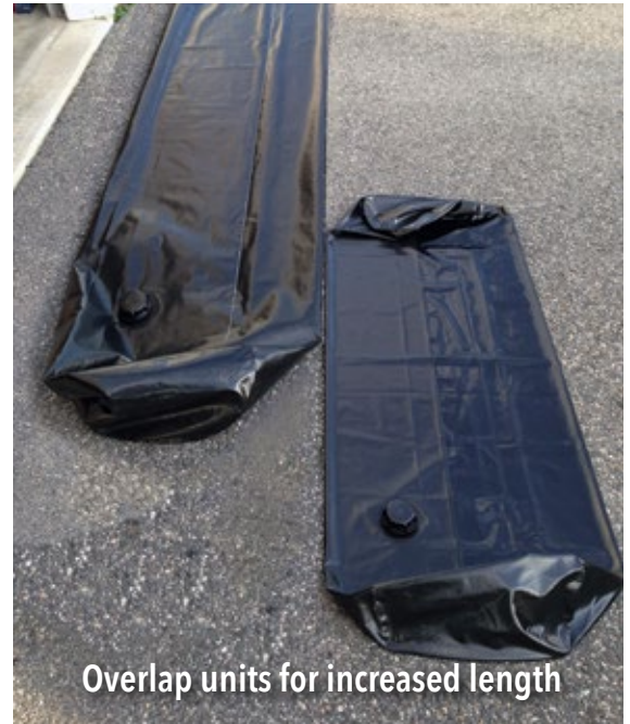
Overlap units for increased length