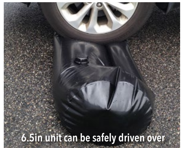
6.5in unit can be safely driven over