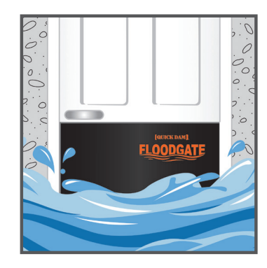
Creates 26in height of flood protection