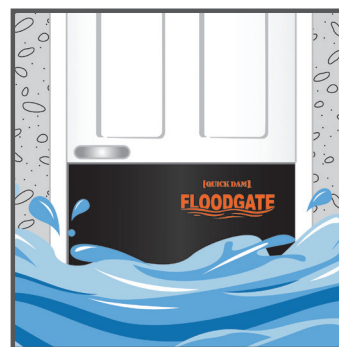
Creates 26in height of flood protection