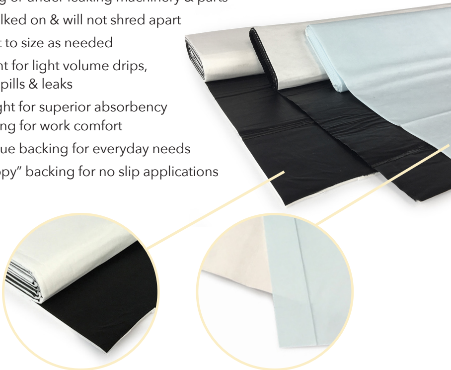
Leak proof backing protects floor