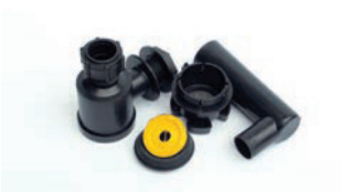
Byelaw 30 Fittings & Backplate

*Oval Kitemarked cisterns and Low Level (Coffin) cisterns only + BM4RTK30 Does not include Byelaw 30 fittings (Lid, Jacket & backing plate only)