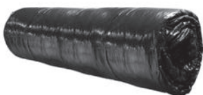
Insulation Jacket (60mm) & Ties