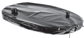
Close Fitting Lid

To make it easier for the installer and help ensure installation complies with the water regulations, we have updated our range and now supply our most popular cisterns with kits.