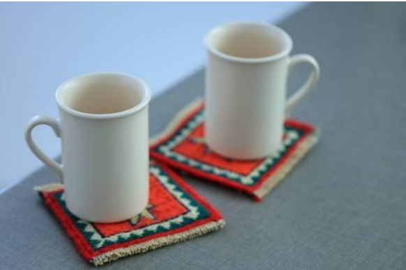
Each kilim product has its own order of patterns and colors.