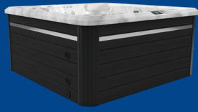
Silver Marble Midnight Everlast