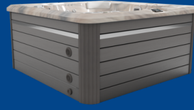
Tuscan Sun Driftwood Everlast