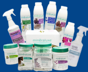
Mineraluxe Water Care Kit