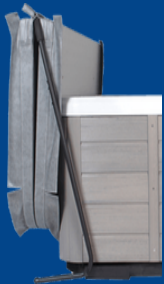
Cover Valet Premium Undermount Cover Lifter