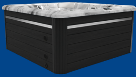
Black Opal Midnight Everlast