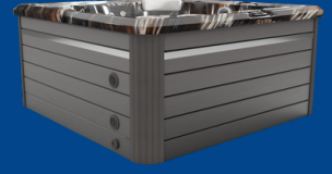
Midnight Canyon Driftwood Everlast

This premium, upgraded quality cabinet is designed to last decades with little to no maintenance. In the unlikely event that you require access to the hot tub plumbing or equipment, all four panels are removable for easy service access.