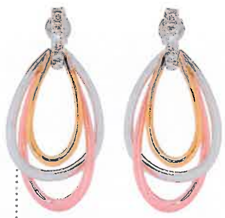
MARTINI Multi Hoop Earrings R2199