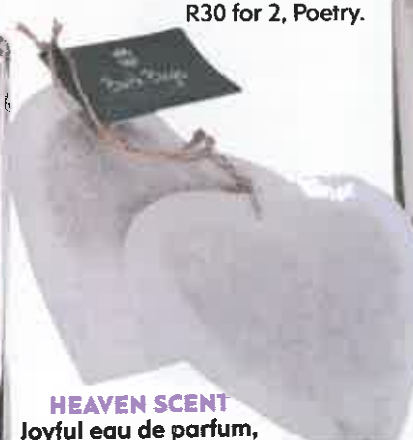
SOAK IN STYLE Bath tea bags, R30 for 2, Poetry.