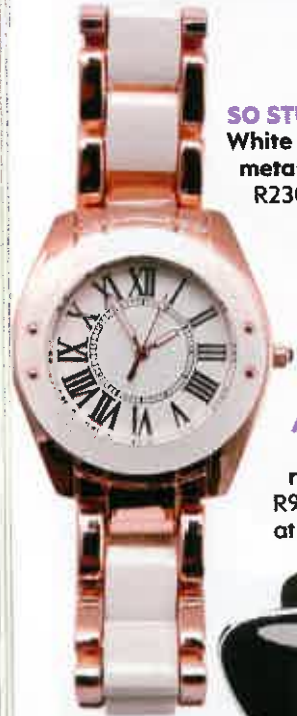
SO STUNNING White and rose metal watch, R230, Zuri.