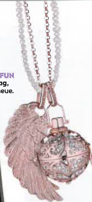
BLING-TASTIC Engelsrufer pendants, from R899 each, Thomas Sabo.