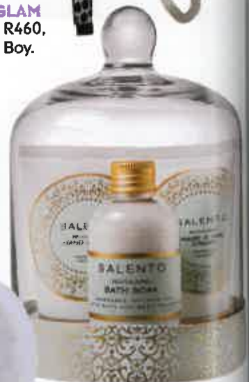
PAMPER PARTY Salento dome gift set, R199, Woolworths.