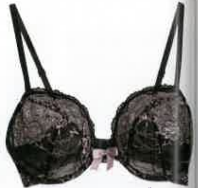
UNDER WHERE? Ciara posy lace bra, R210, and panties, R110, Woolworths.