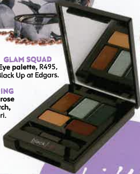
GLAM SQUAD Eye palette, R495, Black Up at Edgars.