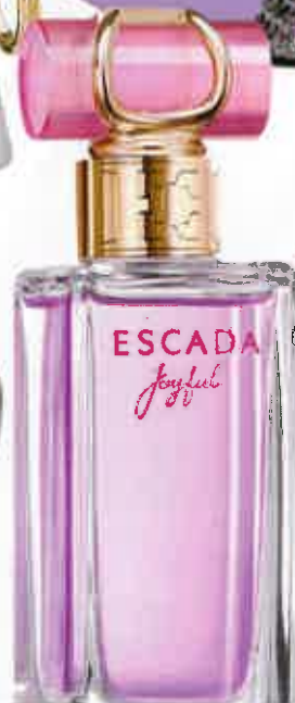
HEAVEN SCENT Joyful eau de parfum,