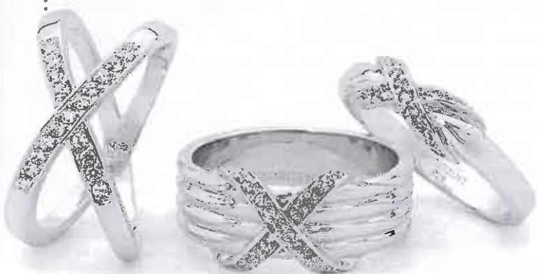
COSMOPOLITAN Cross Rings - Left to Right R1199, R1699, R999