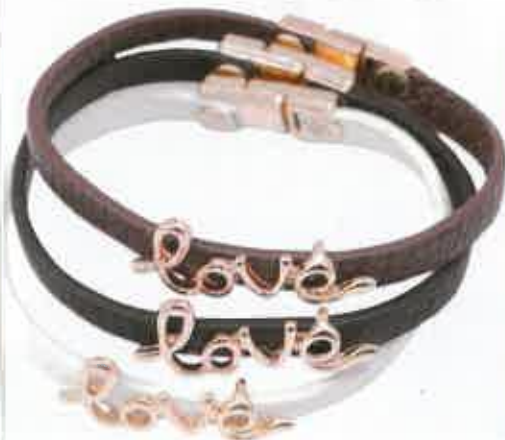
ARM CANDY Love bracelets, R120 for 3, Zuri.