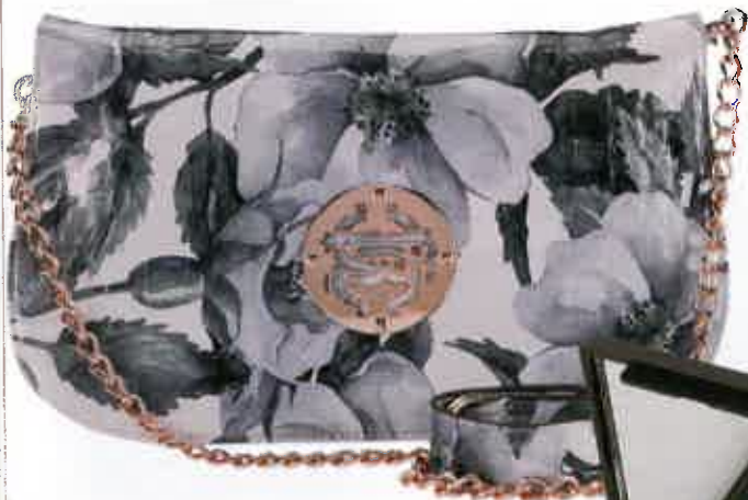
FLORAL FUN Handbag, R349, Queue.