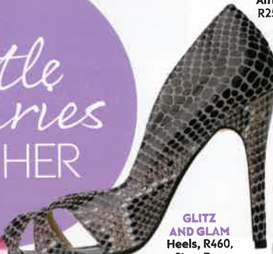
GLITZ AND GLAM Heels, R460, Sissy Boy.