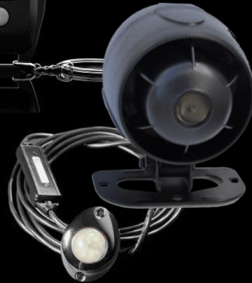
Internet Interface Optional