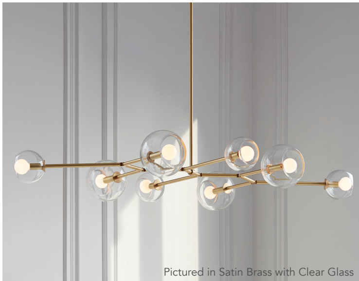
Pictured in Satin Brass with Clear Glass