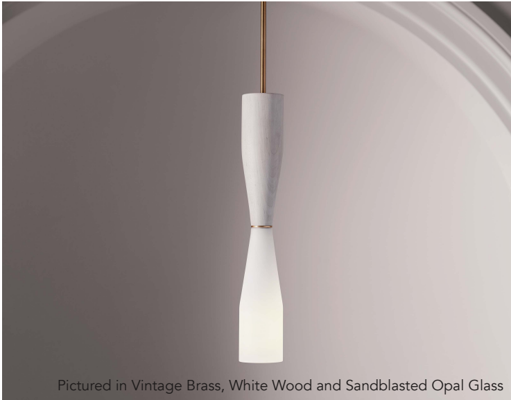
Pictured in Vintage Brass, White Wood and Sandblasted Opal Glass