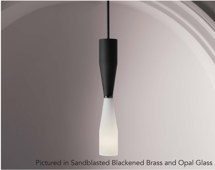
Pictured in Sandblasted Blackened Brass and Opal Glass