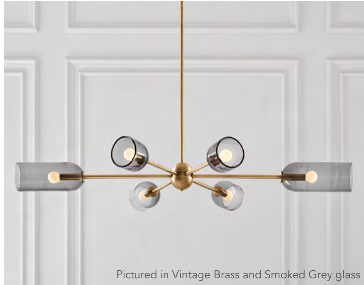
Pictured in Vintage Brass and Smoked Grey glass