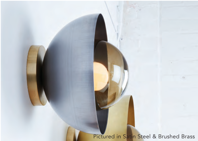
Pictured in Satin Steel & Brushed Brass