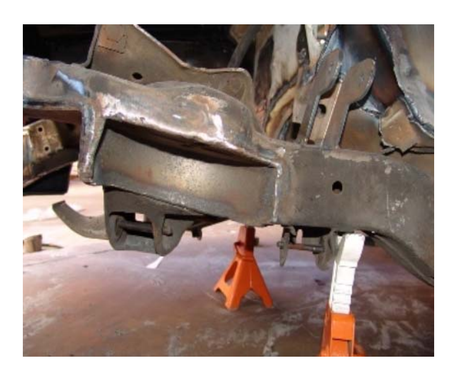
Driver side with control arms and spindles removed. Shown with SPRING POCKET ELIMINATORS & SHOCK RELOCATOR.