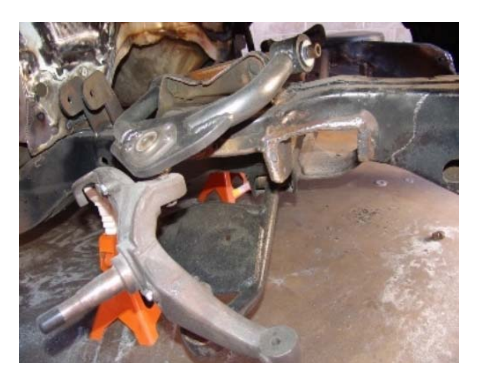
Passenger side with control arms installed and spindle turned to the right. Passenger side with control arms installed and spindle turned to the left. If you are installing Optional Spring Pocket Eliminators,