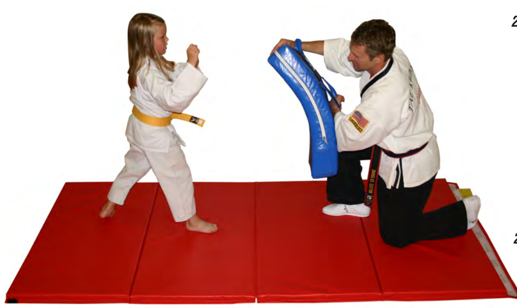
Folding Mats: Available in a variety of sizes and colors.