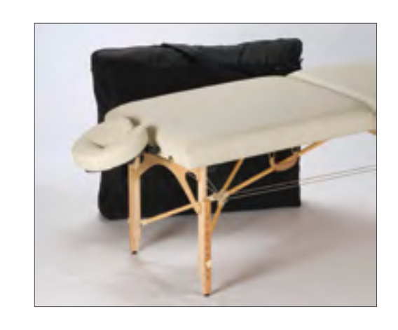
OPTION: Travel bag made of thick heavy duty canvas