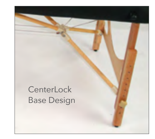
Set up/take down easy while giving ample leg room for therapist

OPTIONS & ADD-ONS: MBW Portable Travel Bag #41001-07 5 lbs.