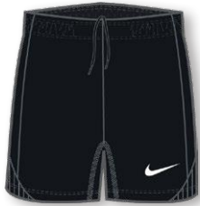
NEW NIKE DF STRIKE 24 SHORT KZ FD7564 Page 40