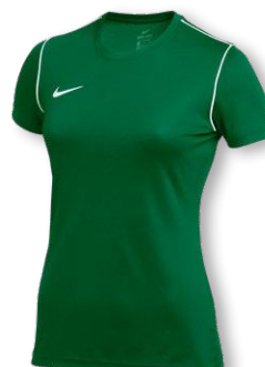
NIKE DRY PARK 20 SS TOP BV6897 Page 58