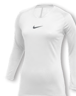
NIKE DRY PARK LS FIRSTLAYER JERSEY AV2610 Page 59