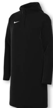
NIKE STORM-FIT ACADEMY HOODED RAIN JACKET DJ6316 Page 55