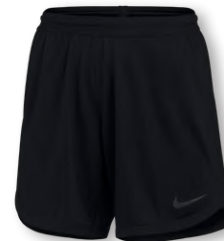
NIKE DF REFEREE SHORT DH8269 Page 35