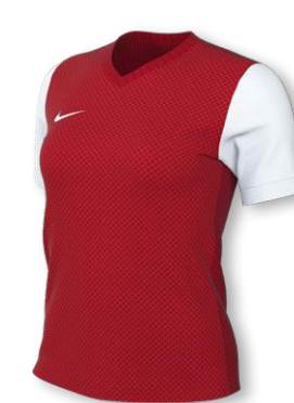
NIKE DF US SS TIEMPO PREMIER II JERSEY DH8235 Page 19