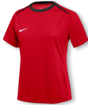
NEW NIKE DF ACADEMY PRO 24 SS TOP K FD7594 Page 46