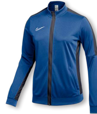
NIKE DF KNIT ACADEMY 23 TRACK JACKET DR1686 Page 48