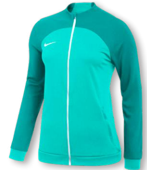
NIKE DF ACADEMY PRO TRACK JACKET K DH9250 Page 51