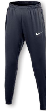
NEW NIKE DF STRIKE 24 PANT KPZ FD7576 Page 38