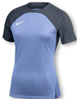
NIKE DF US SS STRIKE III JERSEY DR0910 Page 11