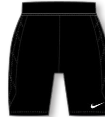
NIKE DF PAD GARDIEN I GK COMPRESSION SHORT CV0055 Page 33