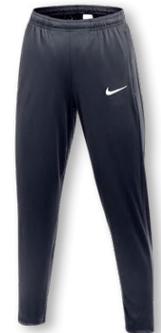
NEW NIKE DF ACADEMY PRO 24 PANT KPZ FD7677 Page 45