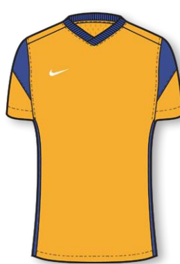
NIKE DRY US SS PARK DERBY III JERSEY CW3832 Page 21