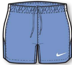
NIKE US WOVEN VENOM SHORT III CW3860 Page 23