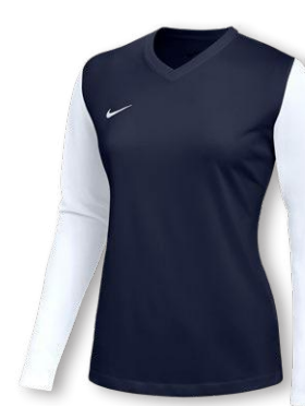
NIKE DF US LS TIEMPO PREMIER II JERSEY DH8236 Page 18