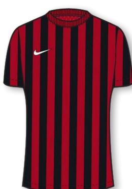
NIKE US SS STRIPED DIVISION IV JERSEY CW3818 Page 16