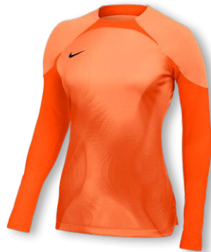
NIKE DF ADV GARDIEN IV GK JERSEY US LS DH8226 Page 32