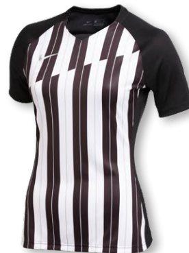
NIKE DRY US SS DIGITAL 20 JERSEY CD6119 Page 27