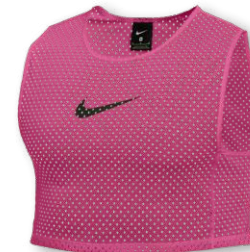
NIKE DRY PARK 20 BIB DV7425 Page 36