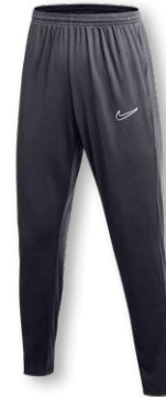
NIKE DF ACADEMY 23 PANT KPZ DR1671 Page 50