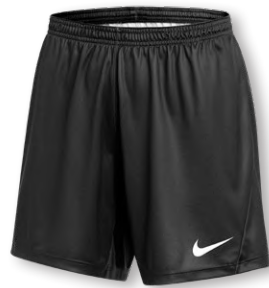
NEW NIKE DF US DIGITAL 24 SHORT 60D FD8772 Page 26