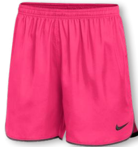
NIKE DF US WOVEN LASER V SHORT DH8302 Page 24