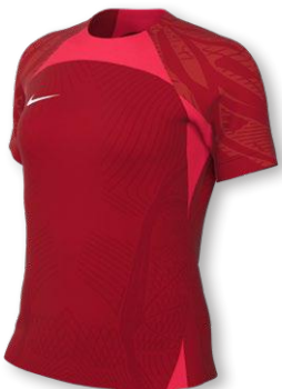
NIKE DF ADV VAPOR IV JERSEY US SS DR0674 Page 10