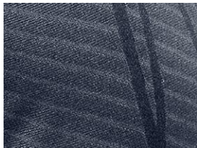
GRAPHIC KNIT DETAIL