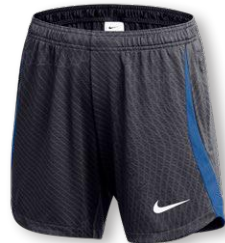
NIKE DF STRIKE 23 SHORT KZ DR2340 Page 43