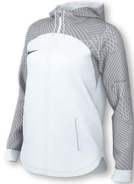
NIKE DF KNIT STRIKE 23 HOODED TRACK JACKET DR2573 Page 41