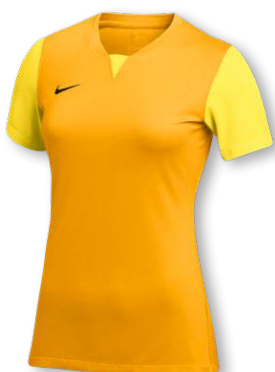
NIKE DF US SS TROPHY V JERSEY DR0940 Page 15