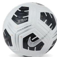
NIKE CLUB ELITE - TEAM CU8057 (NFHS) Page 60