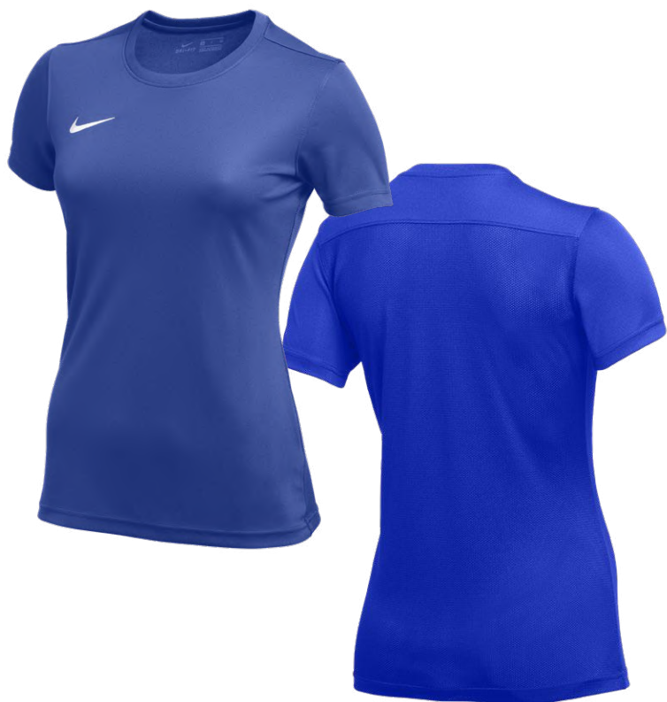
MESH BACK PANEL VIEW