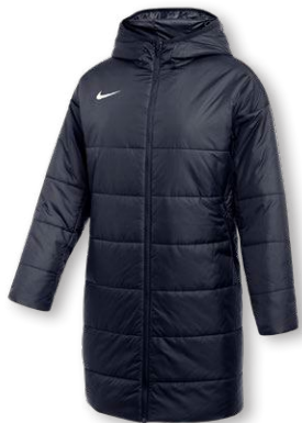
NEW NIKE THERMA-FIT ACADEMY PRO 24 SDF JACKET FD7712 Page 54