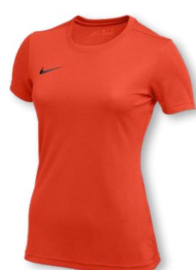
NIKE US SS PARK VII JERSEY BV6730 Page 22