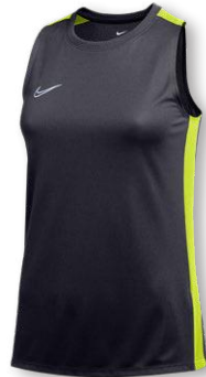
NIKE DF ACADEMY 23 SL TOP DR1332 Page 49