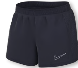
NIKE DF ACADEMY 23 SHORT K DR1362 Page 50