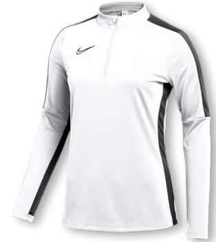
NIKE DF ACADEMY 23 DRILL TOP DR1354 Page 48