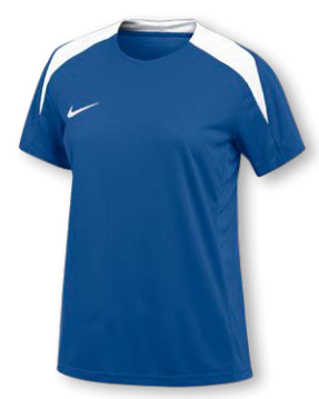
NEW NIKE DF STRIKE 24 SS TOP K FD7490 Page 39