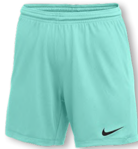
NIKE DRY PARK III SHORT NB BV6862 Page 25