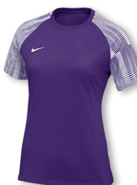
NIKE DF US SS ACADEMY JERSEY DH8232 Page 17