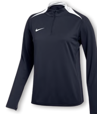
NEW NIKE DF ACADEMY PRO 24 DRILL TOP K FD7669 Page 45