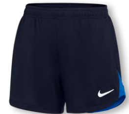
NIKE DF ACADEMY PRO SHORT KZ DH9265 Page 53