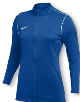
NIKE DRY PARK 20 TRACK JACKET FJ3024 Page 57