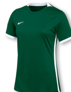
NIKE DF US SS CHALLENGE IV JERSEY DH8231 Page 14