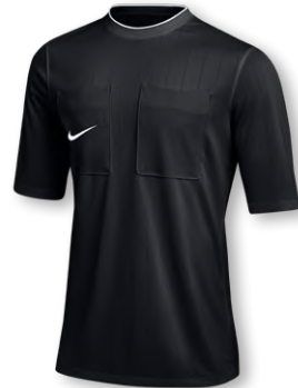
NIKE MEN'S DF REFEREE II SS JERSEY DH8024 Page 35 (MEN'S SIZING. WOMEN'S COMING 1/1/25)