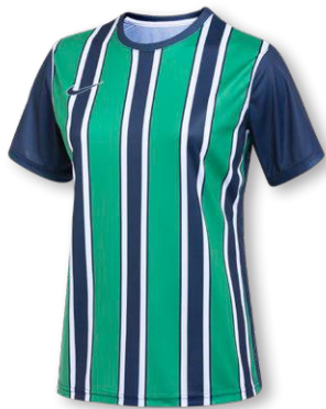
NEW NIKE DF US DIGITAL 24 JERSEY 60D DR2730 Page 26