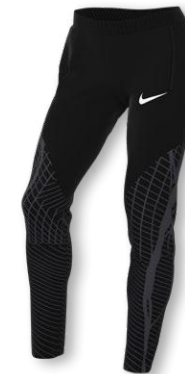
NIKE DF STRIKE 23 PANT KPZ DR2568 Page 42