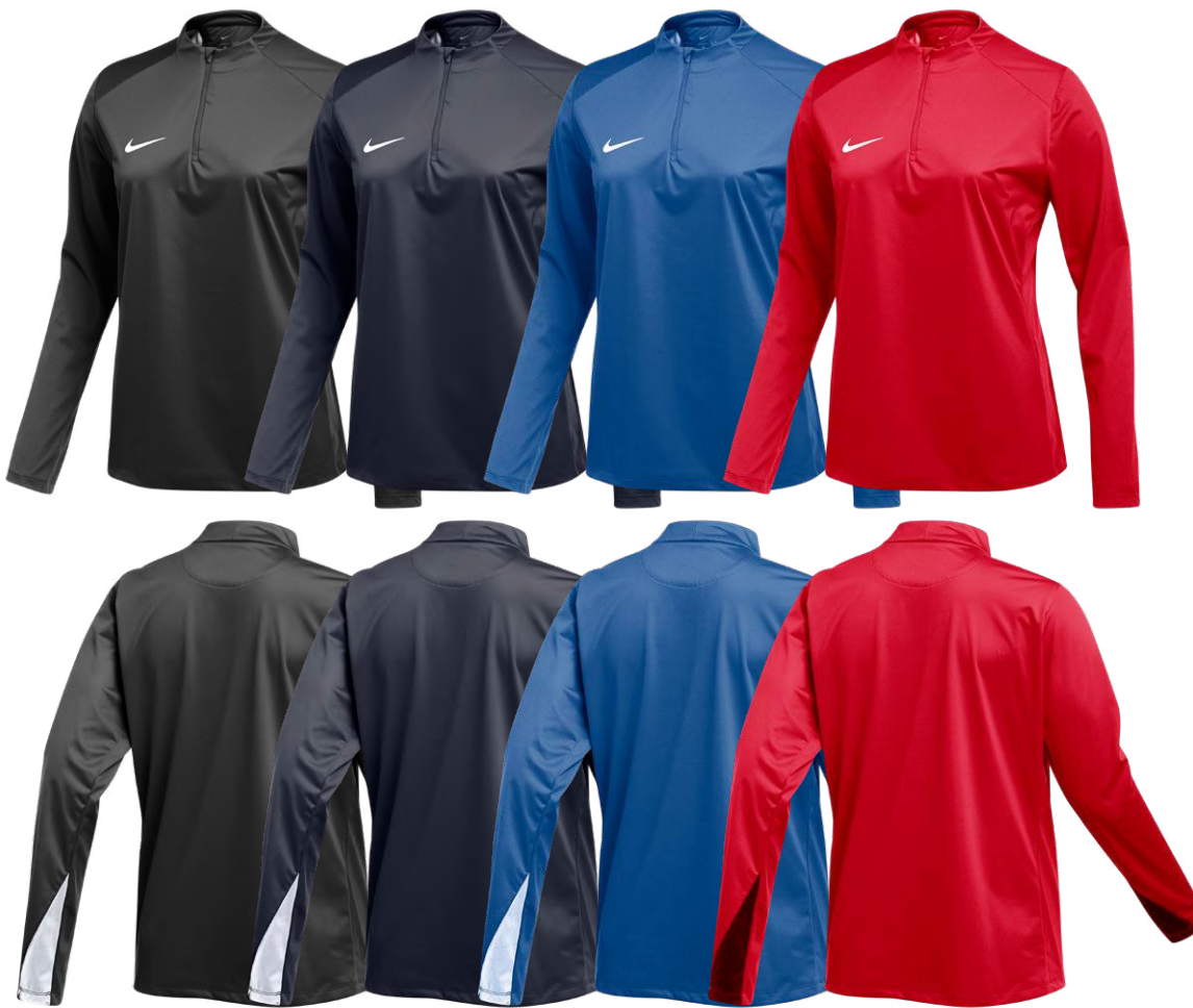
BACK VIEWS TO SHOW SLEEVE COLORS