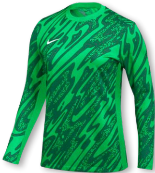
NEW NIKE DF ADV GARDIEN V GK JERSEY US LS FD7479 Page 31