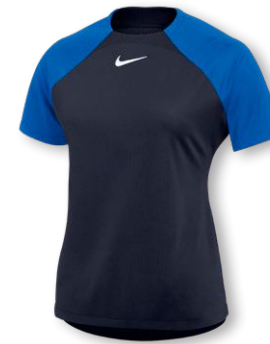
NIKE DF SS ACADEMY PRO TOP K DH9242 Page 53