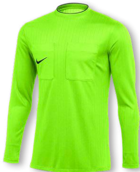
NIKE MEN'S DF REFEREE II LS JERSEY DH8027 Page 35 (MEN'S SIZING. WOMEN'S COMING 1/1/25)