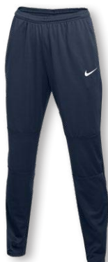
NIKE DRY PARK 20 PANT FJ3019 Page 59