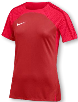
NIKE DF STRIKE 23 SS TOP DR2278 Page 43