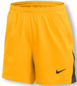
NEW NIKE DF VENOM WOVEN SHORT IV US FD7471 Page 23