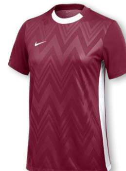
NEW NIKE DF CHALLENGE V JERSEY SS US FD7425 Page 13