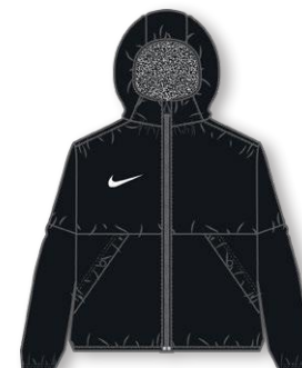
NIKE THERMA REPEL PARK 20 FALL JACKET DC8039 Page 56