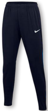
NIKE DF ACADEMY PRO PANT KPZ DH9273 Page 51