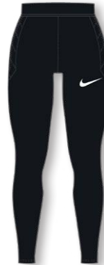
NIKE DF PAD GARDIEN I GK COMPRESSION TIGHT CV0048 Page 33