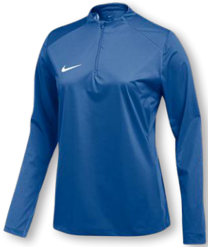
NEW NIKE STORM-FIT STRIKE 24 DRILL TOP FD7589 Page 37