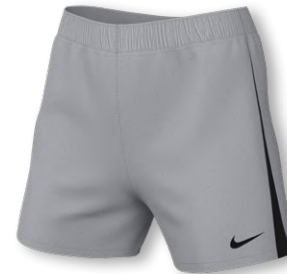
NIKE DF US LEAGUE KNIT III SHORT DR0965 Page 24