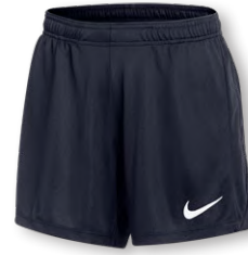
NEW NIKE DF ACADEMY PRO 24 SHORT KZ FD7655 Page 47