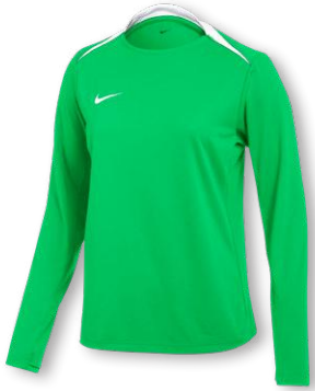
NEW NIKE DF ACADEMY PRO 24 CREW TOP K FD7659 Page 46