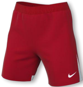
NIKE DF US CLASSIC II SHORT K DH8310 Page 25