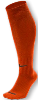
NIKE ACADEMY OTC SOCK SX5728 Page 29