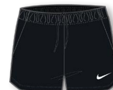
NIKE DRY PARK 20 SHORT KZ CW6154 Page 58