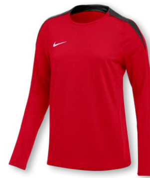
NEW NIKE DF STRIKE 24 CREW TOP K FD7567 Page 39