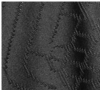
GRAPHIC KNIT DETAIL