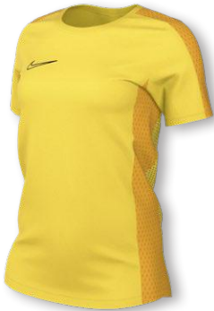
NIKE DF ACADEMY 23 SS TOP DR1338 Page 49