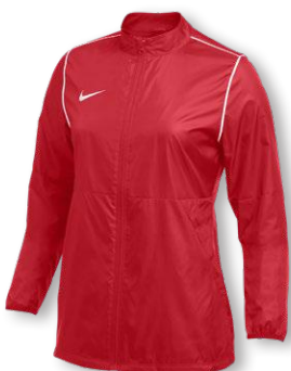
NIKE PARK 20 RAIN JACKET BV6895 Page 57