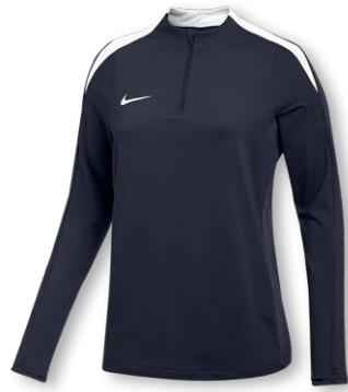
NEW NIKE DF STRIKE 24 DRILL TOP K FD7571 Page 38