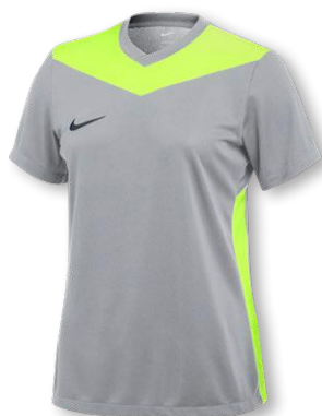
NEW NIKE DF PARK DERBY IV JERSEY SS US FD7437 Page 20