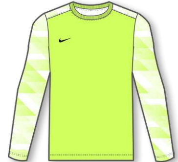
NIKE DRY LS US PARK IV GK JERSEY CJ6071 Page 34