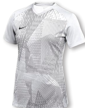
NIKE DF US SS PRECISION VI JERSEY DR0948 Page 12