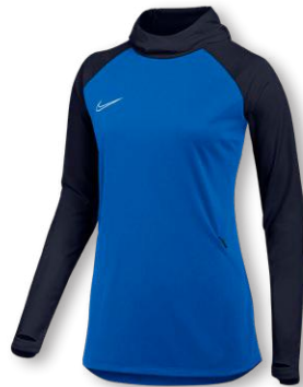
NIKE DF ACADEMY PRO PO HOODIE K DH9248 Page 52