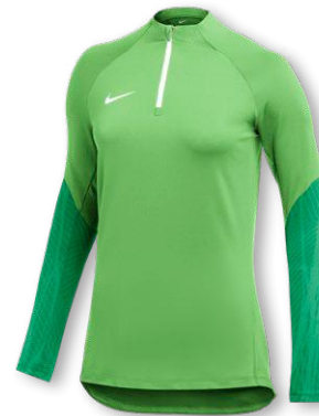
NIKE DF STRIKE 23 DRILL TOP DR2296 Page 42