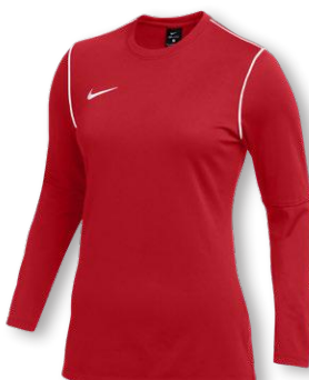
NIKE DRY PARK 20 CREW TOP FJ3006 Page 58