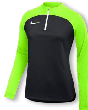
NIKE DF ACADEMY PRO DRILL TOP K DH9246 Page 52