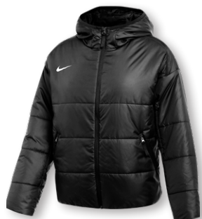
NEW NIKE THERMA-FIT ACADEMY PRO 24 FALL JACKET FD7704 Page 54