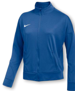
NEW NIKE DF ACADEMY PRO 24 TRACK JACKET K FD7683 Page 44