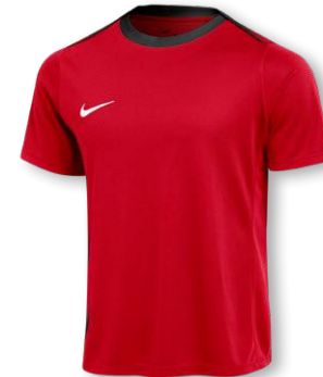
NEW NIKE DF ACADEMY PRO 24 SS TOP K FD7592 Page 45