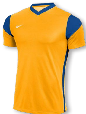
NIKE DRY US SS PARK DERBY III JERSEY CW3828 Page 21