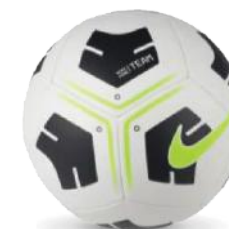
NIKE PARK - TEAM CU8033 Page 58