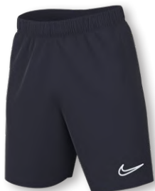
NIKE DF ACADEMY 23 SHORT K DR1360 Page 48