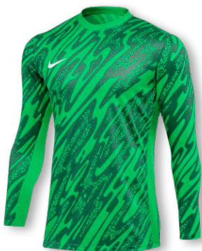
NEW NIKE DF ADV GARDIEN V GK JERSEY US LS FD7476 Page 31