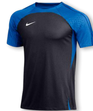
NIKE DF STRIKE 23 SS TOP DR2276 Page 42