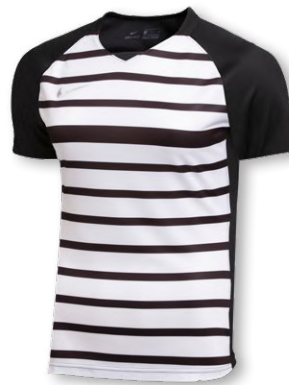
NIKE DRY US SS DIGITAL 20 JERSEY CD6117 Page 27