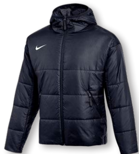
NEW NIKE THERMA-FIT ACADEMY PRO 24 FALL JACKET FD7702 Page 52