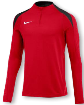
NEW NIKE DF STRIKE 24 DRILL TOP K FD7569 Page 38