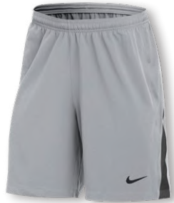
NEW NIKE DF VENOM WOVEN SHORT IV US FD7442 Page 23