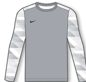
NIKE DRY LS US PARK IV GK JERSEY CJ6068 Page 34