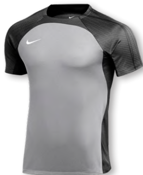
NIKE DF US SS STRIKE III JERSEY DR0890 Page 11