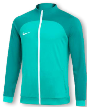
NIKE DF ACADEMY PRO TRACK JACKET K DH9234 Page 49