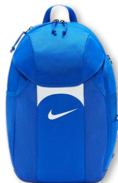
NIKE ACADEMY TEAM BACKPACK 2.3 DV0761 Page 58