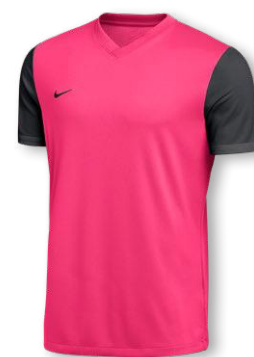
NIKE DF US SS TIEMPO PREMIER II JERSEY DH8044 Page 19