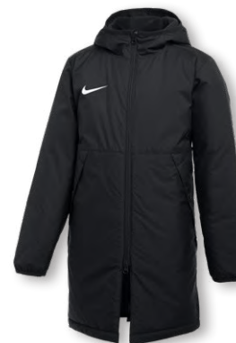
NIKE SYN FL REPEL PARK 20 SDF JACKET CW6156 Page 54