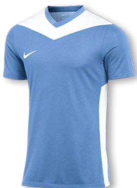
NEW NIKE DF PARK DERBY IV JERSEY SS US FD7432 Page 20