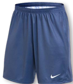
NEW NIKE DF US DIGITAL 24 SHORT 60D FD8765 Page 26