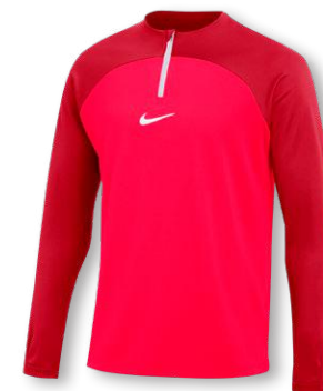
NIKE DF ACADEMY PRO DRILL TOP K DH9230 Page 50