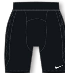
NIKE DF PAD GARDIEN I GK COMPRESSION SHORT CV0053 Page 33