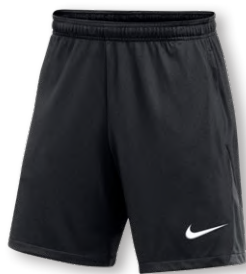
NIKE DF ACADEMY PRO SHORT KZ DH9238 Page 51