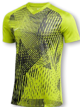
NIKE DF US SS PRECISION VI JERSEY DR0945 Page 12