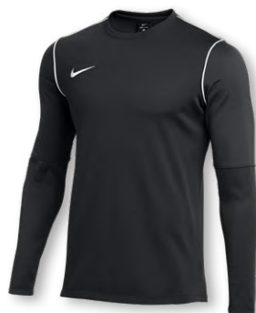
NIKE DRY PARK 20 CREW TOP FJ3004 Page 56