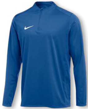
NEW NIKE STORM-FIT STRIKE 24 DRILL TOP FD7587 Page 37