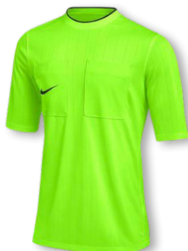
NIKE DF REFEREE II SS JERSEY DH8024 Page 35