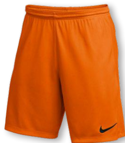
NIKE DRY PARK III SHORT NB BV6857 Page 25