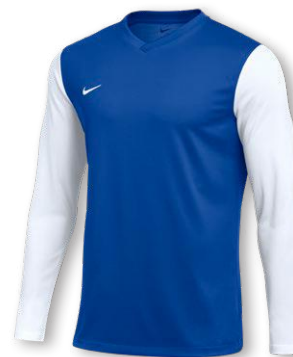
NIKE DF US LS TIEMPO PREMIER II JERSEY DH8046 Page 18