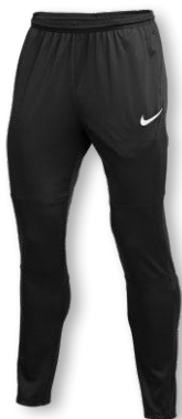
NIKE DRY PARK 20 PANT FJ3017 Page 57