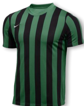
NIKE US SS STRIPED DIVISION IV JERSEY CW3815 Page 16