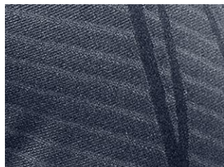
GRAPHIC KNIT DETAIL