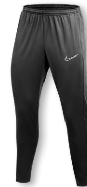
NIKE DF ACADEMY 23 PANT KPZ DR1666 Page 48