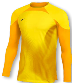
NIKE DF ADV GARDIEN IV GK JERSEY US LS DH7977 Page 32