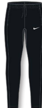
NEW NIKE DF ACADEMY PRO 24 PANT KPZ FD7672 Page 44