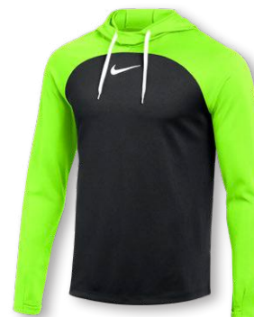
NIKE DF ACADEMY PRO PO HOODIE K DH9232 Page 50