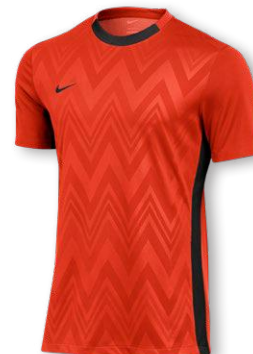
NEW NIKE DF CHALLENGE V JERSEY SS US FD7417 Page 13