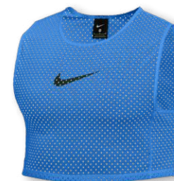
NIKE DRY PARK 20 BIB DV7425 Page 36