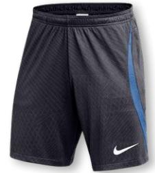
NIKE DF STRIKE 23 SHORT KZ DR2332 Page 42