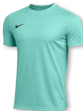
NIKE US SS PARK VII JERSEY BV6710 Page 22