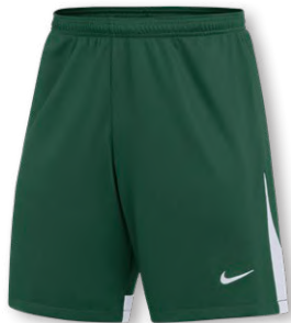
NIKE DF US CLASSIC II SHORT K DH8127 Page 25