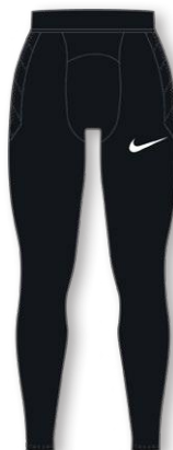
NIKE DF PAD GARDIEN I GK COMPRESSION TIGHT CV0045 Page 33