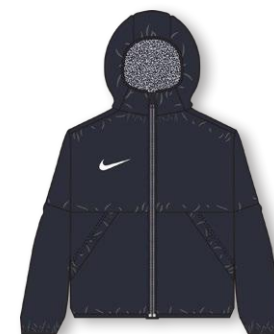
NIKE THERMA REPEL PARK 20 FALL JACKET CW6157 Page 54