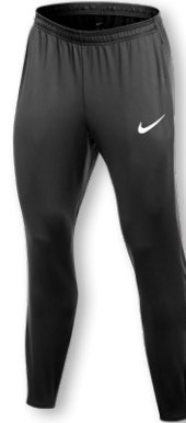
NEW NIKE DF STRIKE 24 PANT KPZ FD7574 Page 38