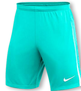
NIKE DF US LEAGUE KNIT III SHORT DR0961 Page 24