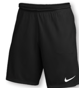
NIKE DRY DIGITAL 20 SHORT CD6118 Page 27