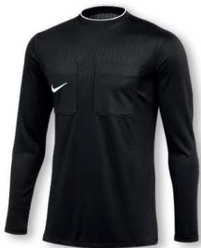
NIKE DF REFEREE II LS JERSEY DH8027 Page 35