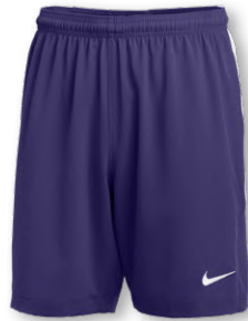
NIKE US WOVEN VENOM SHORT III CW3857 Page 23