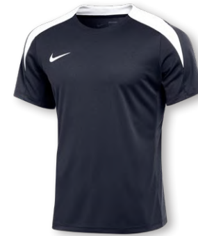
NEW NIKE DF STRIKE 24 SS TOP K FD7487 Page 39