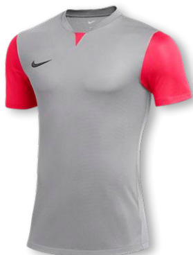
NIKE DF US SS TROPHY V JERSEY DR0934 Page 15