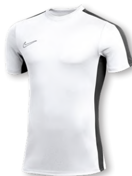
NIKE DF ACADEMY 23 SS TOP DR1336 Page 47