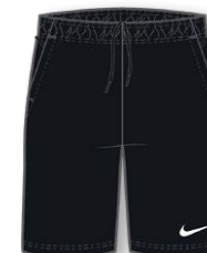
NIKE DRY PARK 20 SHORT KZ CW6152 Page 56