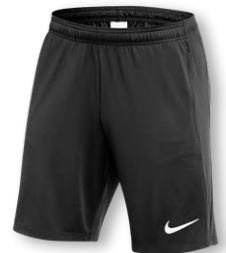
NEW NIKE DF ACADEMY PRO 24 SHORT KZ FD7633 Page 45