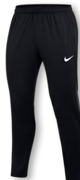
NIKE DF ACADEMY PRO PANT KPZ DH9240 Page 49