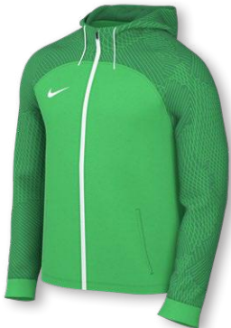
NIKE DF KNIT STRIKE 23 HOODED TRACK JACKET DR2571 Page 40