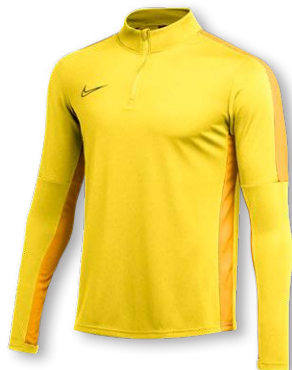
NIKE DF ACADEMY 23 DRILL TOP DR1352 Page 46