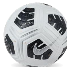
NIKE CLUB ELITE - TEAM CU8057 (NFHS) Page 58