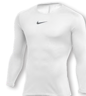
NIKE DRY PARK LS FIRSTLAYER JERSEY AV2609 Page 57