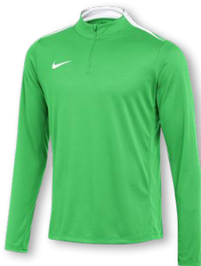
NEW NIKE DF ACADEMY PRO 24 DRILL TOP K FD7667 Page 44