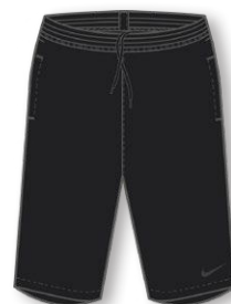
NIKE DF REFEREE SHORT AA0737 Page 35