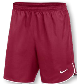
NIKE DF US WOVEN LASER V SHORT DH8116 Page 24