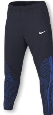
NIKE DF STRIKE 23 PANT KPZ DR2563 Page 41