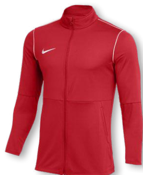
NIKE DRY PARK 20 TRACK JACKET FJ3022 Page 55