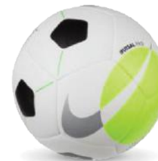
NIKE FUTSAL PRO - TEAM DH1992 Page 58