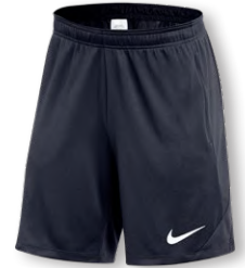
NEW NIKE DF STRIKE 24 SHORT KZ FD7550 Page 390