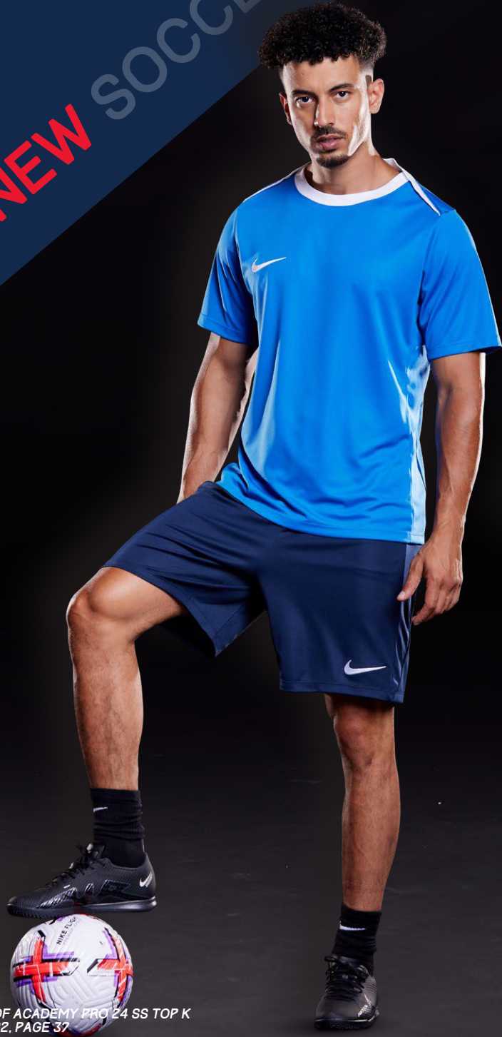
NIKE DF ACADEMY PRO 24 SS TOP K FD7592, PAGE 37

ON THE COVER: NIKE DF CHALLENGE V JERSEY SS US FD7417, PAGE 13 NIKE DF US WOVEN LASER V SHORT DH8116, PAGE 24