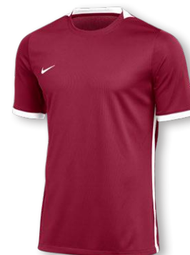
NIKE DF US SS CHALLENGE IV JERSEY DH8003 Page 14