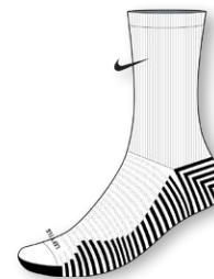
NIKE SQUAD CREW – EC20 SK0030 Page 30