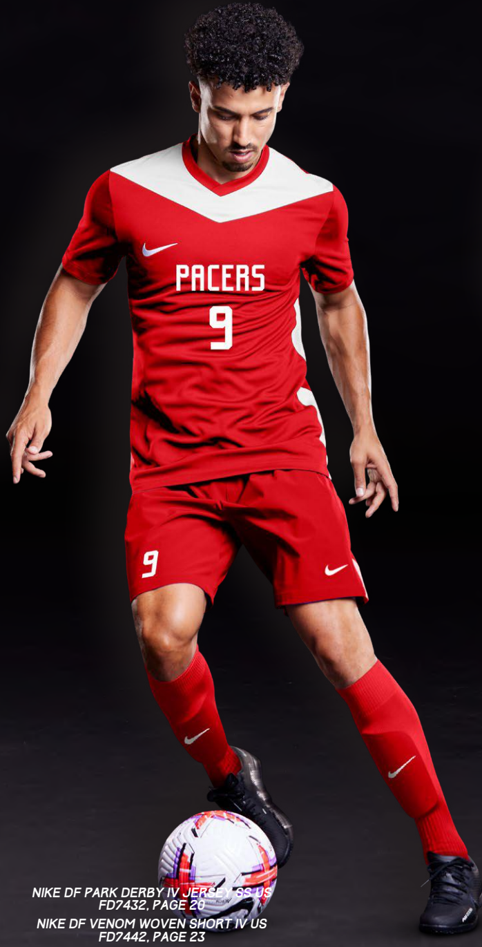
NIKE DF PARK DERBY IV JERSEY SS US FD7432, PAGE 20 NIKE DF VENOM WOVEN SHORT IV US FD7442, PAGE 23