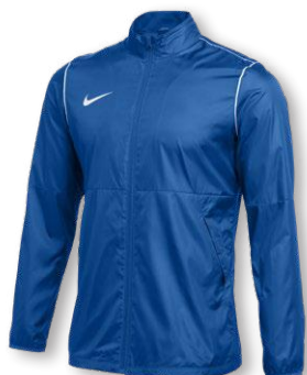
NIKE PARK 20 RAIN JACKET BV6881 Page 55