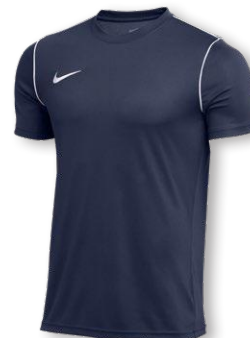
NIKE DRY PARK 20 SS TOP BV6883 Page 56