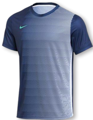
NEW NIKE DF US DIGITAL 24 JERSEY 60D DR2728 Page 26