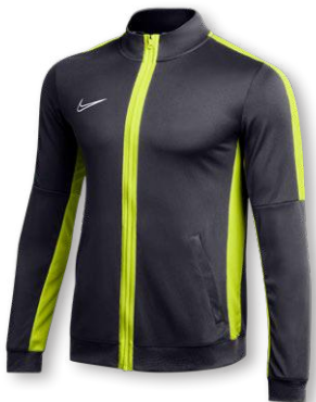
NIKE DF KNIT ACADEMY 23 TRACK JACKET DR1681 Page 46