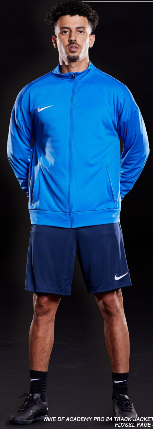
NIKE DF ACADEMY PRO 24 TRACK JACKET K FD7681, PAGE 43