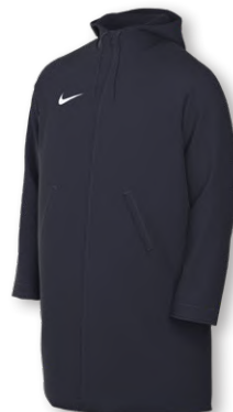
NIKE STORM-FIT ACADEMY HOODED RAIN JACKET DJ6301 Page 53