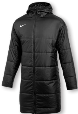
NEW NIKE THERMA-FIT ACADEMY PRO 24 SDF JACKET FD7709 Page 52