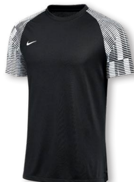
NIKE DF US SS ACADEMY JERSEY DH8033 Page 17