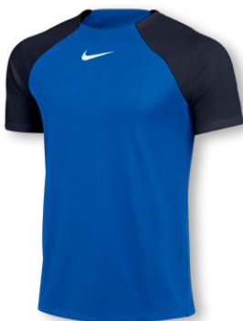
NIKE DF SS ACADEMY PRO TOP K DH9225 Page 51