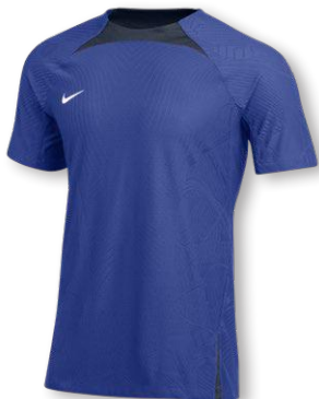
NIKE DF ADV VAPOR IV JERSEY US SS DR0671 Page 10