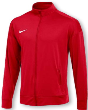
NEW NIKE DF ACADEMY PRO 24 TRACK JACKET K FD7681 Page 43