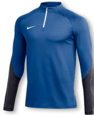
NIKE DF STRIKE 23 DRILL TOP DR2294 Page 41