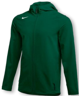
NIKE STOCK THERMA LS PRE-GAME FZ HOODIE CT2693 Page 13