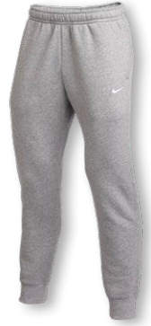
NIKE TEAM CLUB PANT CJ1616 Page 15