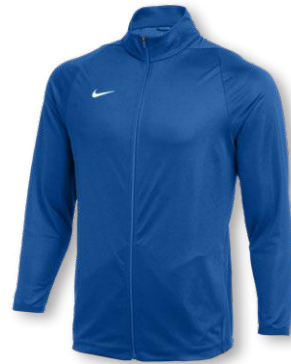
NIKE EPIC KNIT JACKET 2.0 CN9409 Page 12