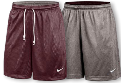
NIKE STOCK STANDARD ISSUE REVERSIBLE SHORT DZ4688 Page 39