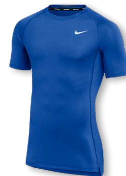
NIKE PRO TIGHT SS TRAINING TOP DH4800 Page 33