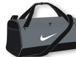
NIKE BRASILIA SMALL DUFFEL 9.5 DM3976 Page 41