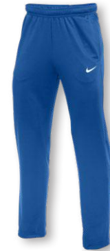
NIKE EPIC KNIT PANT 2.0 CN9470 Page 12