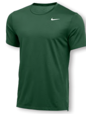
NIKE TEAM HYPER DF SHORT SLEEVE TOP CU9468 Page 19