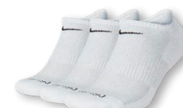
NIKE EVERYDAY PLUS CUSHION NO SHOW 3PPK SX6889 Page 43