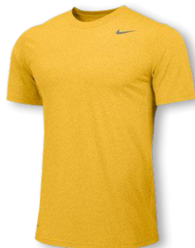
NIKE TEAM LEGEND SS CREW DV7299 Page 23