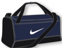
NIKE BRASILIA XSMALL DUFFEL 9.5 DM3977 Page 41