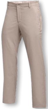
NIKE TEAM FLEX PANT CU9429 Page 37