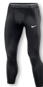
NIKE PRO 3/4 TRAINING TIGHT DH4780 Page 36