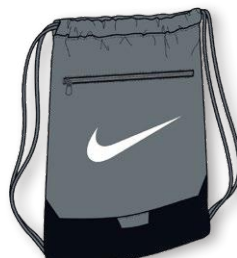
NIKE BRASILIA DRAWSTRING 9.5 DM3978 Page 42