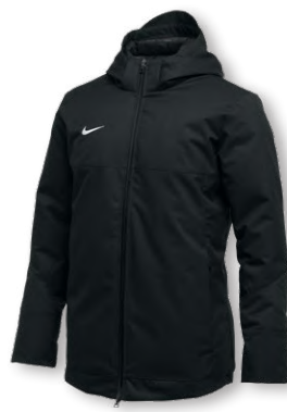
NIKE TEAM DOWN FILL PARKA DJ6526 Page 28