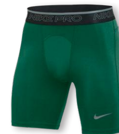
NIKE PRO TRAINING COMPRESSION SHORT DH4762 Page 36