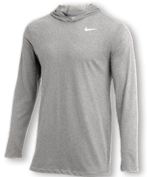
NIKE DF LONG SLEEVE HOODIE TEE CJ1696 Page 20