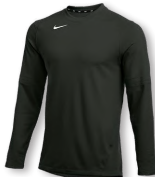
NIKE STOCK LS CREW PRE-GAME TOP CT4050 Page 21