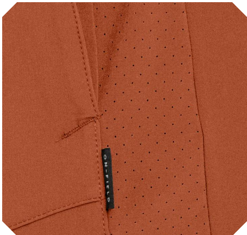
SIDE INSET DETAIL