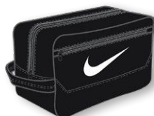
NIKE BRASILIA SHOE BAG 9.5 DM3982 Page 42