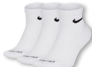
NIKE EVERYDAY PLUS CUSHION ANKLE 3PPK SX6890 Page 43