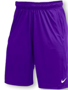
NIKE TEAM KNIT SHORT CU3460 Page 40