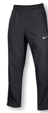
NIKE WATERPROOF PANT DA4984 Page 29