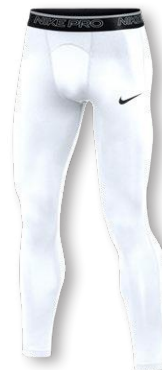
NIKE PRO TRAINING TIGHT DH4769 Page 35