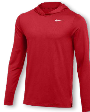
NIKE TEAM HYPER DF LONG SLEEVE TOP CU9458 Page 19