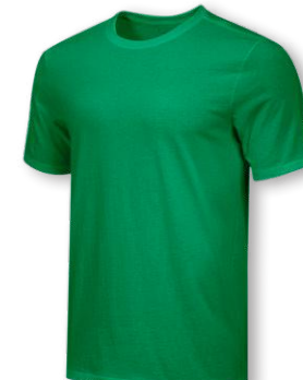
NIKE CORE SS COTTON CREW CJ1693 Page 24