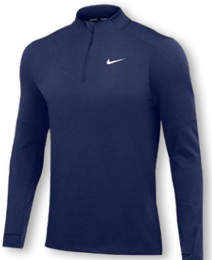
NIKE DRI-FIT ELEMENT 1/2-ZIP TOP DH4949 Page 17