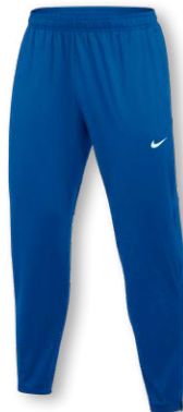
NIKE DRI-FIT ELEMENT PANT DH4950 Page 18