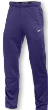
NIKE THERMA PANT REGULAR CN9483 Page 11