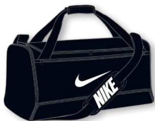
NIKE BRASILIA LARGE DUFFEL 9.5 D09193 Page 41