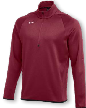
NIKE THERMA LS 1/4-ZIP TOP CN9492 Page 13