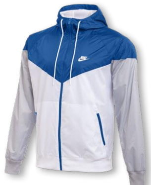
NIKE TEAM WINDRUNNER JACKET HD CU9474 Page 31