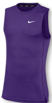
NIKE PRO SLEEVELESS TRAINING TOP DH4796 Page 33