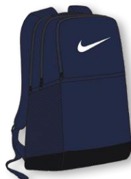
NIKE BRASILIA MEDIUM BACKPACK 9.5 DH7709 Page 41