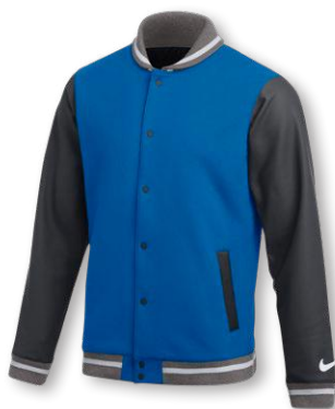
NIKE STOCK LETTERMAN JACKET DJ5971 Page 27