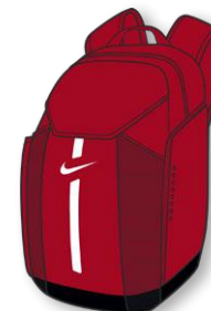
NIKE ACADEMY TEAM BACKPACK DC2647 Page 42