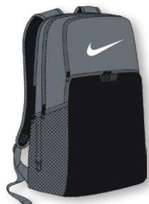
NIKE BRASILIA BACKPACK XL 9.5 DM3975 Page 41