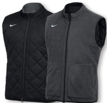
NIKE TEAM REVERSIBLE VEST CW8038 Page 30