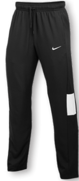
NIKE DRI-FIT PANT CV0096 Page 9