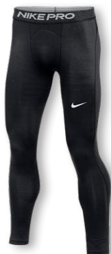
NIKE PRO WARM TRAINING TIGHT DH4802 Page 35