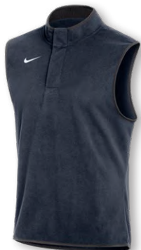
NIKE THERMA VEST DA4965 Page 30