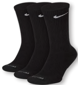
NIKE EVERYDAY PLUS CUSHION CREW 3PPK SX6888 Page 43