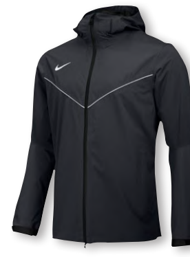
NIKE WATERPROOF JACKET DA4967 Page 29