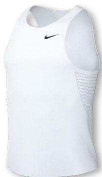
NIKE PRO DRI-FIT COMPRESSION TANK DZ4690 Page 34