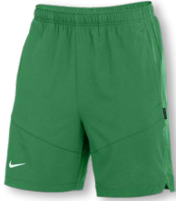
NIKE DF PLAYER POCKET SHORT CW5409 Page 38