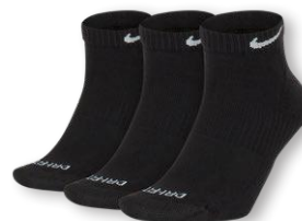
NIKE EVERYDAY PLUS CUSHION LOW 3PPK SX7040 Page 43