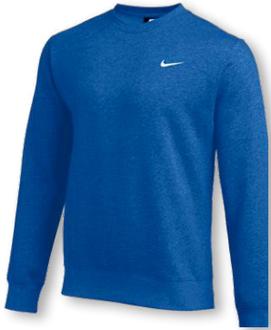
NIKE TEAM CLUB CREW CJ1614 Page 15