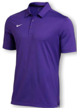
NIKE DRI-FIT FRANCHISE POLO CI4470 Page 26