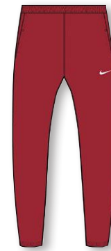
NIKE TEAM MILER REPEL PANT DH8110 Page 10