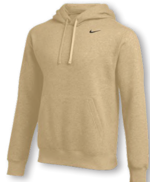
NIKE TEAM CLUB PULLOVER HOODIE CJ1611 Page 16