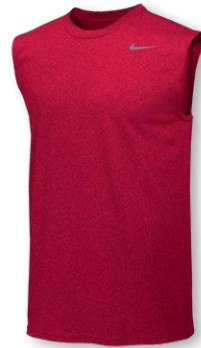
NIKE TEAM LEGEND SL CREW DV7307 Page 23