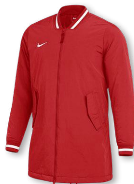
NIKE STOCK DUGOUT JACKET DC9103 Page 28