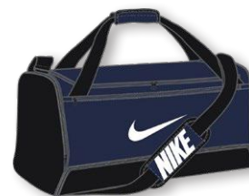
NIKE BRASILIA MEDIUM DUFFEL 9.5 DH7710 Page 41