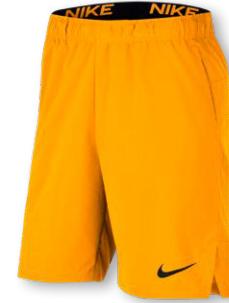
NIKE TEAM DF FLEX WOVEN SHORT DJ8686 Page 39