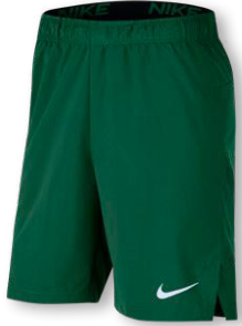
NIKE TEAM DF FLEX WOVEN SHORT NO POCKETS DJ8693 Page 40