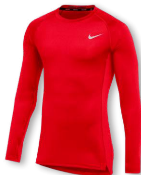
NIKE PRO TIGHT LS TRAINING TOP DH4791 Page 32