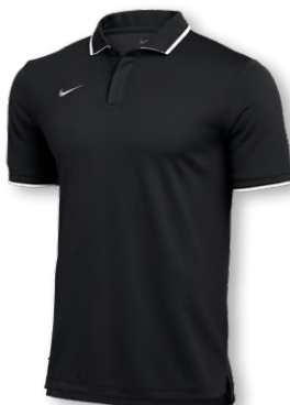
NIKE DF POLO UV COLLEGIATE CW3415 Page 25