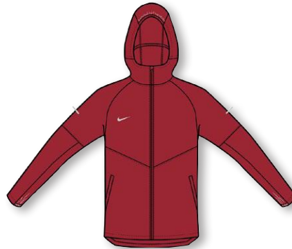
NIKE TEAM MILER REPEL JACKET DH8109 Page 10