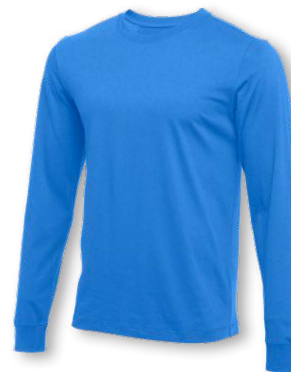
NIKE CORE LS COTTON CREW CJ1690 Page 24