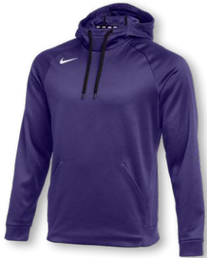
NIKE THERMA PULLOVER HOODIE CN9473 Page 11