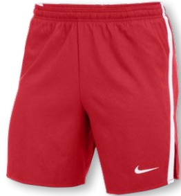
NIKE STOCK FAST 7IN SHORT CV2941 Page 40