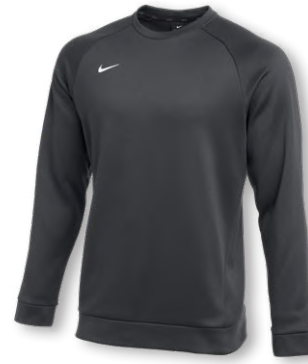
NIKE THERMA CREW CN9511 Page 14