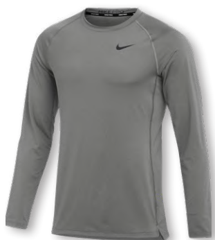
NIKE PRO SLIM LS TRAINING TOP DH4788 Page 32