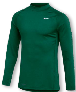
NIKE PRO MOCK-NECK LS TRAINING TOP DH4806 Page 32