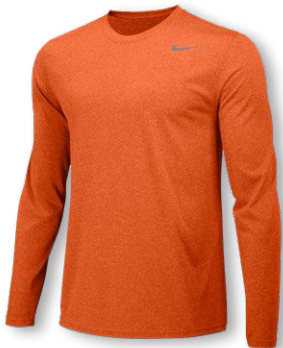
NIKE TEAM LEGEND LS CREW DV7298 Page 22