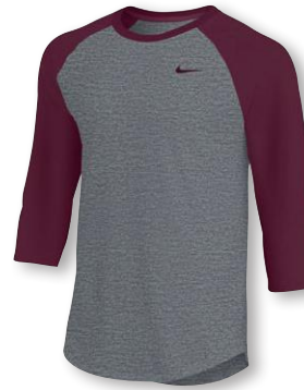
NIKE DF 3/4 SLEEVE RAGLAN TOP CJ1617 Page 21