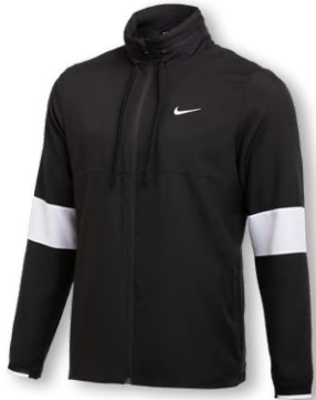
NIKE DRI-FIT JACKET CV0094 Page 9