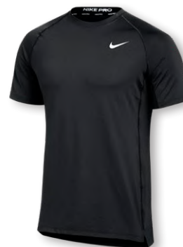
NIKE PRO SLIM SS TRAINING TOP DH4798 Page 33