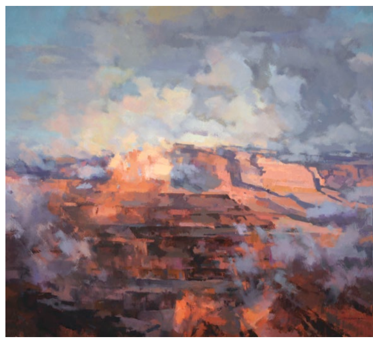
Clouds Unfold - Canyonlands, oil on canvas, 36 x 40"

"If you scale up, the viewer's experience is different because you can't take it all in at once," she says of the experience of viewing a massive painting. "When you're out in the field, you also can't really take in [the entire landscape] at once. Your visual experience is many [smaller moments] happening all at