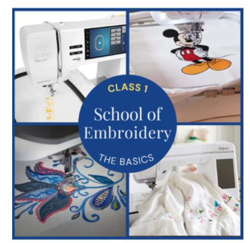
School of Embroidery Class 1: San Jose