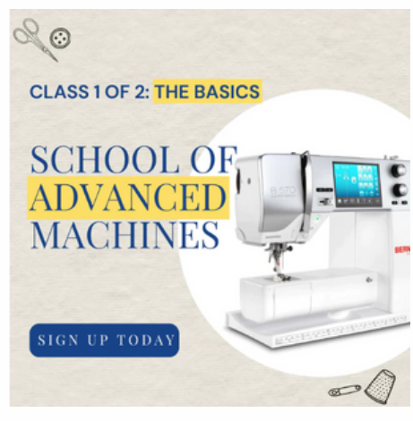
School of Advanced Machines Roseville