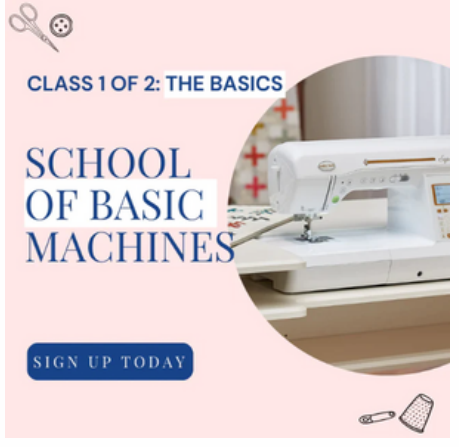
School of Basic Machines Roseville