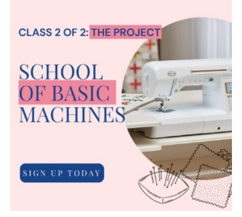
School of Basic Machines Class 2: Folsom