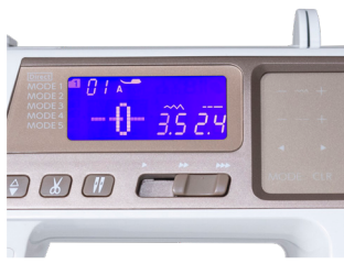
Innovative LCD Screen with Fast Navigation