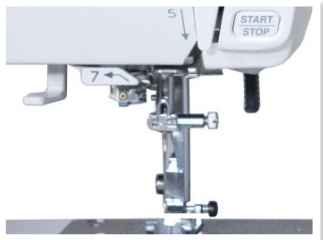
Superior Needle Threader with Thread Guide 7 (5300)