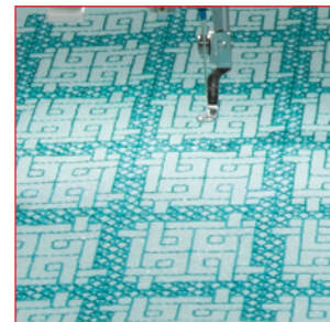
Built-in Sashiko and Wedding designs