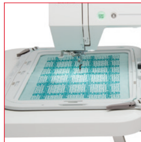
Maximum Embroidery Size: 7.9" x 14.2"