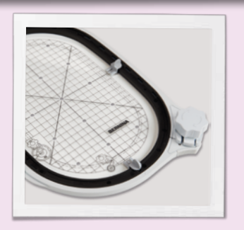
BERNINA Midi Hoop New, optional embroidery hoop with twist-lock mechanism for easy and confident hooping. Size: 265 x 165 mm, 10.5x6.5 inches