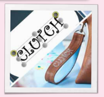
Pinpoint Placement Place your design on the fabric exactly where you want it—quickly and precisely. No need to use the template anymore.