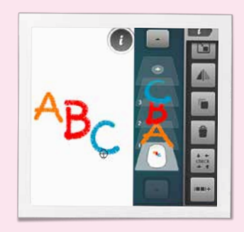
Group & Ungroup Combine designs to edit all at one time with group. Break apart designs to edit individually with ungroup.