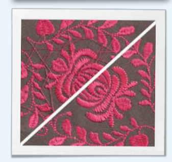
Thread Away Mode

Pulls the threads to the underside for clean embroidery results on the top. Program jump stitch length to manage thread cuts. Subject to design properties.