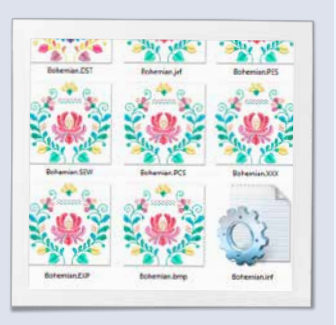
Read Multiple Formats Read most popular file formats. EXP, DST, PES, PEC, JEF, SEW, PCS, XXX.

Toggle Between mm & Inches The embroidery design size and the hoop dimensions fabric to achieve the best results. can be shown in mm or inches.