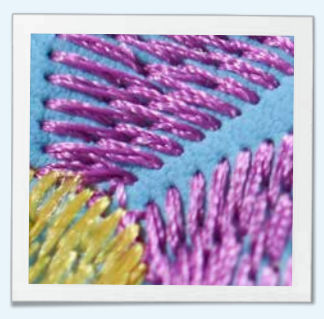
Invisible & Smart Secure Securing stitches become invisible as the tie-on/off stitches are sewn in stitch direction. Smart secure adds tie-on/off stitches to a design, if none are preset.

Pulls the threads to the underside for clean embroidery results on the top. Program jump stitch length to manage thread cuts. Subject to design properties.