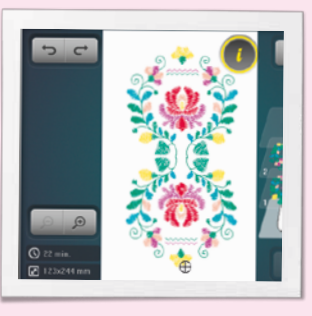
Undo & Redo Simply undo or redo steps while editing or combining designs to return to your initial position.