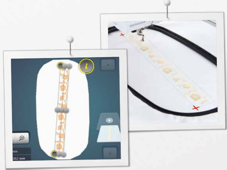
The B 700 Embroidery includes an embroidery module with extra-large embroidery area (400 mm × 210 mm).

Accurately place designs with Pinpoint Placement, a great new feature for easy positioning and alignment. Simply select two points on the screen, match them with the markings on the hooped fabric, and have the design either aligned, rotated or resized to fit as desired. Have full visibility of the hooped fabric at all times, no additional tools or aids are needed.