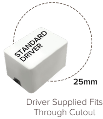
Driver Supplied Fits Through Cutout