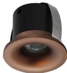
POLISHED COPPER PRODUCT CODE: CHLOE-BZL-PC