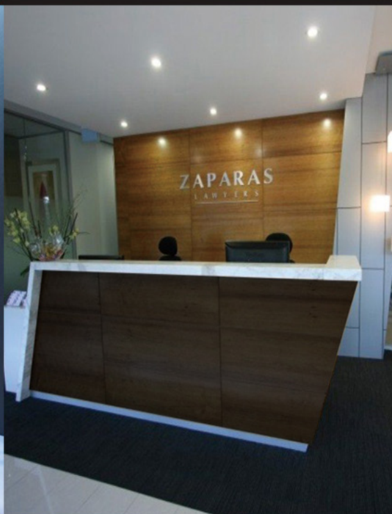
ACCENT/ WALL WASH