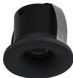
MATT ANTHRACITE GREY PRODUCT CODE: CHLOE-BZL-GREY