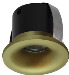
POLISHED BRASS PRODUCT CODE: CHLOE-BZL-PB