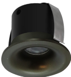
ANTIQUE BRASS PRODUCT CODE: CHLOE-BZL-AB