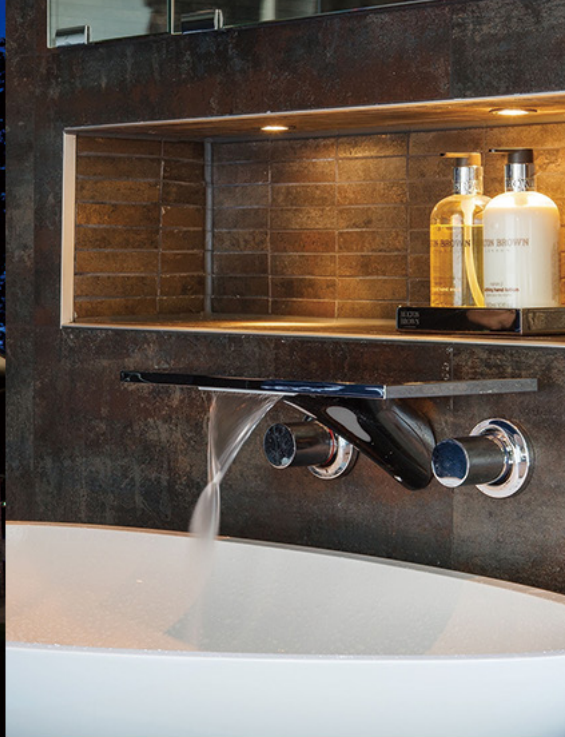
ALCOVE / NICHE LIGHTING