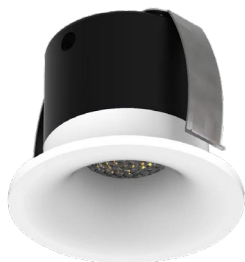
MATT WHITE (PAINTABLE BEZEL)