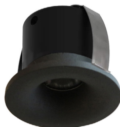
MATT BLACK PRODUCT CODE: CHLOE-BZL-BLK

FOLLOWING BEZEL RANGE IS ONLY SUITABLE FOR INDOOR & BATHROOM USAGE ( SOLD SEPARATELY )