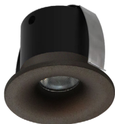
BRONZE PRODUCT CODE: CHLOE-BZL-BRZ

FOLLOWING BEZEL RANGE IS ONLY SUITABLE FOR INDOOR & BATHROOM USAGE ( SOLD SEPARATELY )