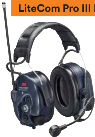
3M™ PELTOR™ WS™ LiteCom Pro III Headset