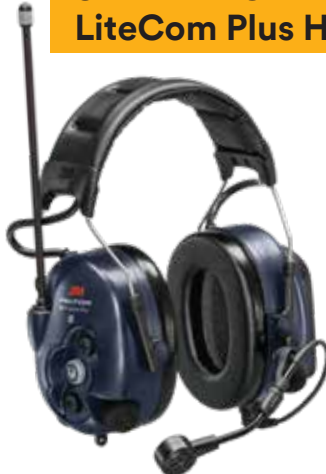
3M™ PELTOR™ WS™ LiteCom Plus Headset