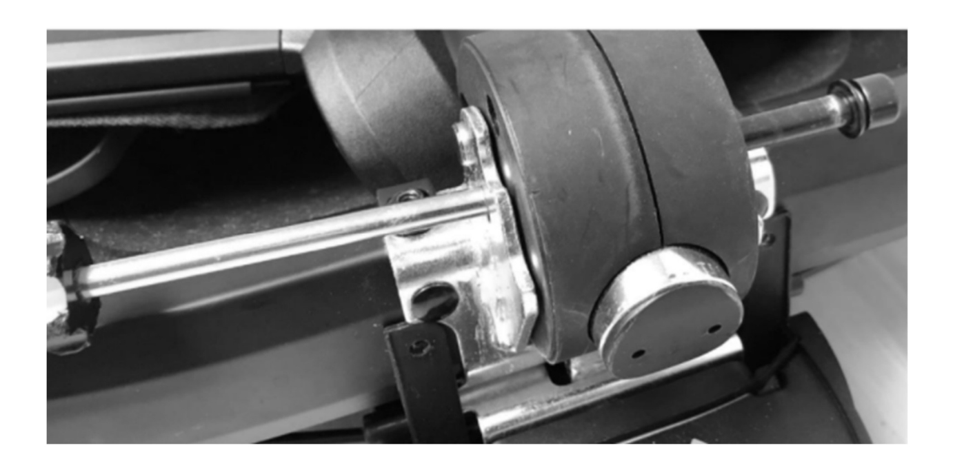
Step 9: Tighten the pivot nut to remove excessive side-to-side handle play. Verify the handle locking pin is able to slide freely to ensure proper handle function. Reference "Handle Locking Pin Function" video for more information.