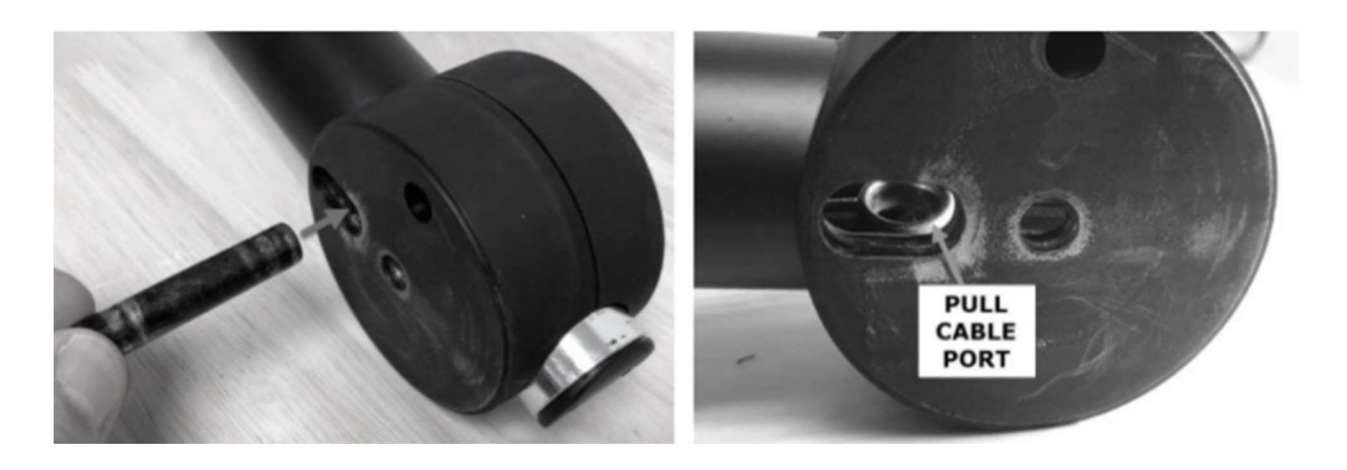
Step 8: Place the new handle onto the cruiser and insert the pivot bolt. To install the pivot bolt it is helpful to use a screwdriver to compress the spring in the lower lock pin as you slide the bolt through the hole.