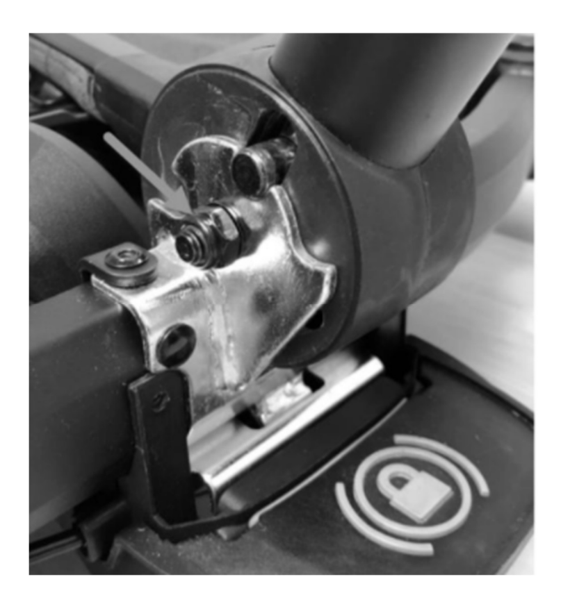
Step 10 : Reinstall the handle pivot covers and screws by following the reverse process of Steps 1, 2, and 3.