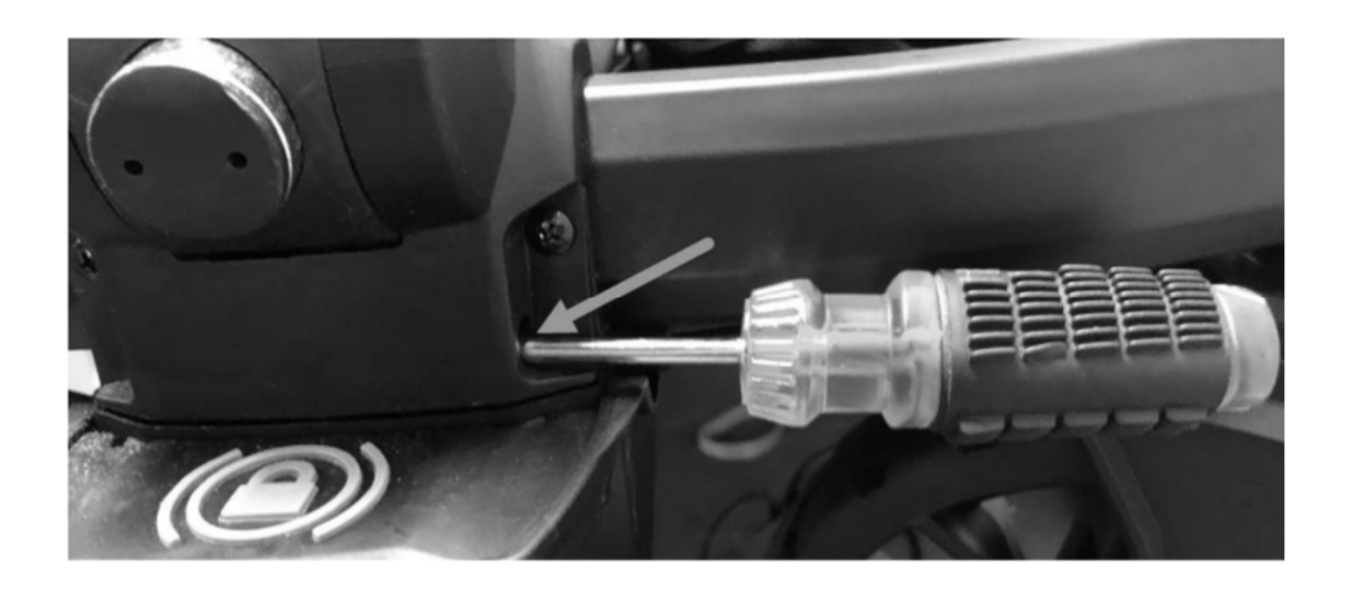
Step 4 : Remove handle pivot covers to expose the handle pivot nut and bolt.